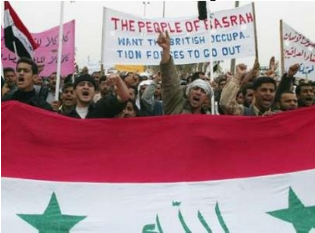
Iraqis protest against British occupation forces in Basra, February 14, 2006.

OCCUPATION ISN'T LIBERATION BRING ALL THE TROOPS HOME NOW!