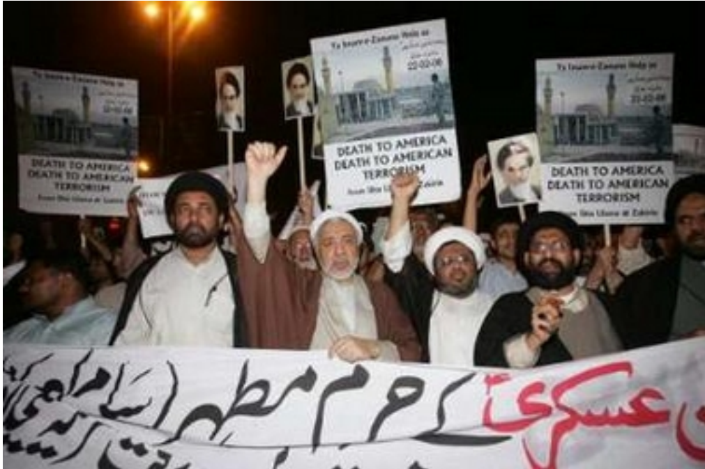
Pakistani Shi'ite Muslim clerics protest in Karachi against an attack on the Golden Mosque in Iraq February 22, 2006.