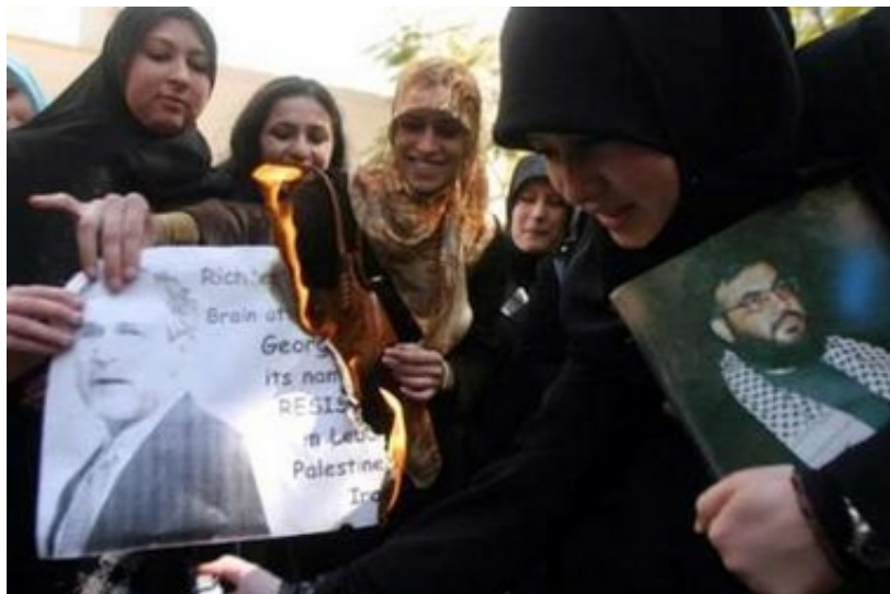
Lebanese students burn a placard of President George W. Bush during a sit-in held in the southern port-city of Sidon February 23, 2006.