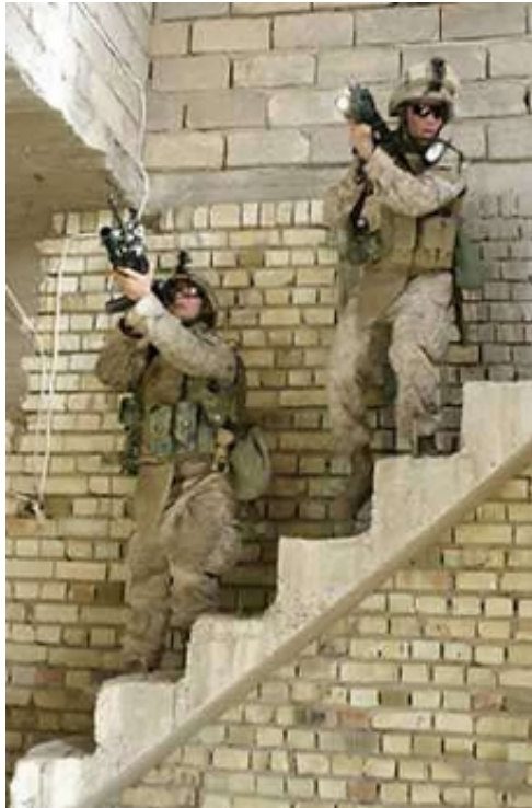
U.S. Marines with the 6th Marine Regiment search a house in Asragiya June 10, 2005.