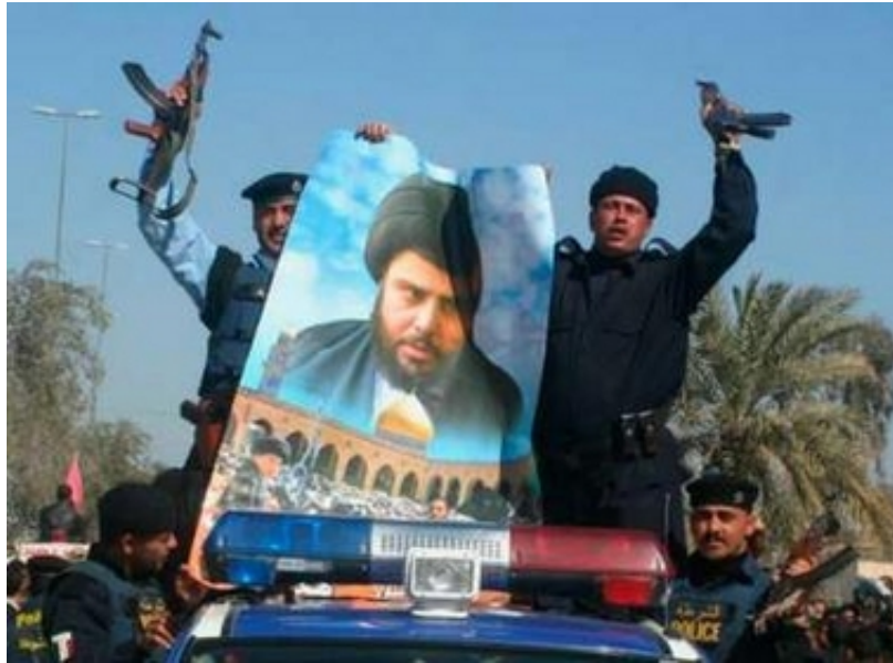
Iraqi policemen display a poster of anti-occupation political leader Moqtada al-Sadr in Najaf, February 24, 2006.