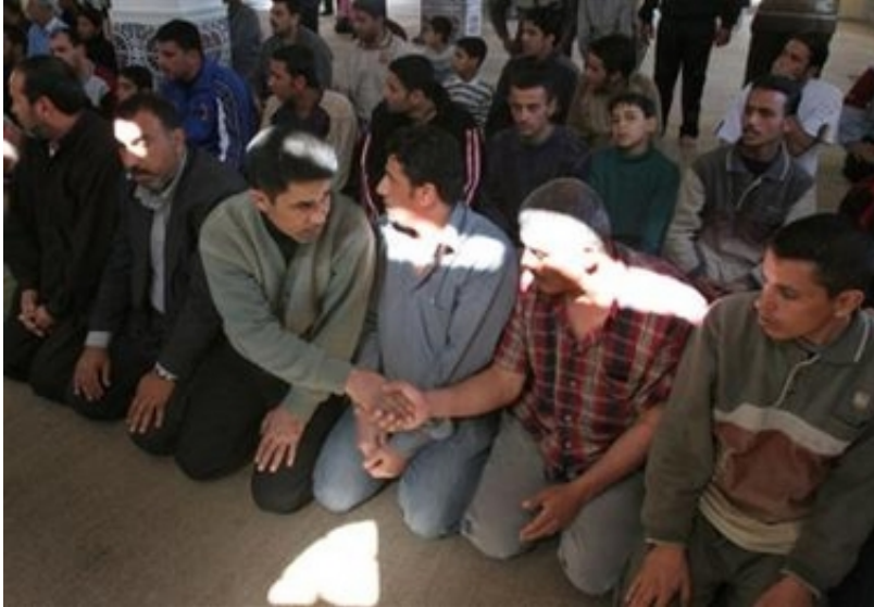
An Iraqi Sunni Muslim, in red shirt, shakes hand with a Shiite Muslim after a joint afternoon prayer, in Shiite district of Sadr City, in Baghdad Feb. 25, 2006.