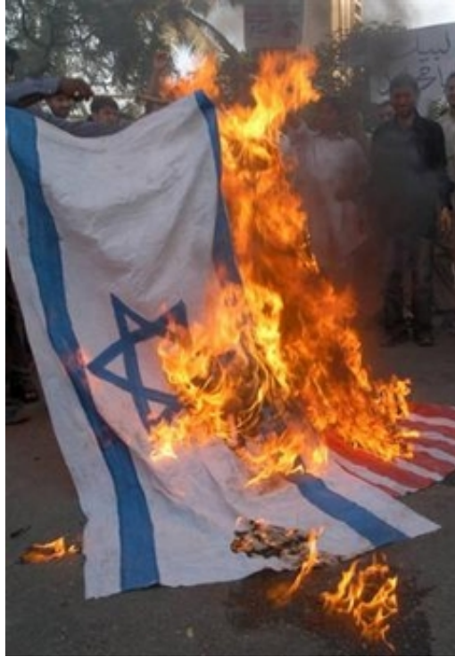
Pakistani Muslims burn United States and Israeli flags in Karachi, Pakistan, Feb. 22, 2006.