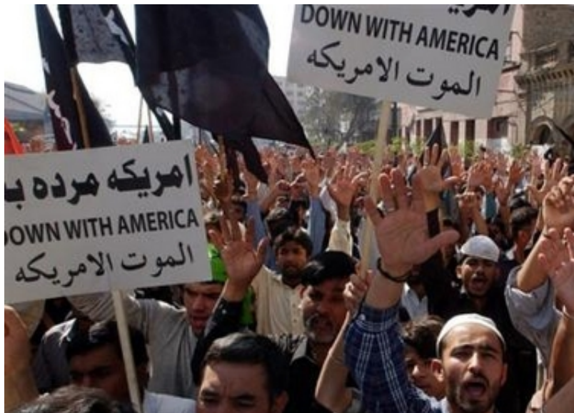
Demonstration against the U.S. occupation of Iraq in Karachi, Pakistan, Feb 24, 2006.