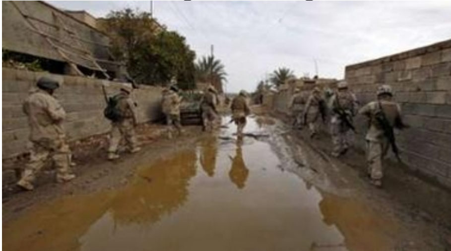
Marines from the 22nd Expeditionary Unit searching houses near Hit January 28, 2006.

THERE IS ABSOLUTELY NO COMPREHENSIBLE REASON TO BE IN THIS FUCKED UP LOCATION AT THIS TIME, EXCEPT THAT A CROOKED POLITICIAN WHO LIVES IN THE WHITE HOUSE WANTS YOU THERE, SO HE WILL LOOK GOOD. That is not a good enough reason.