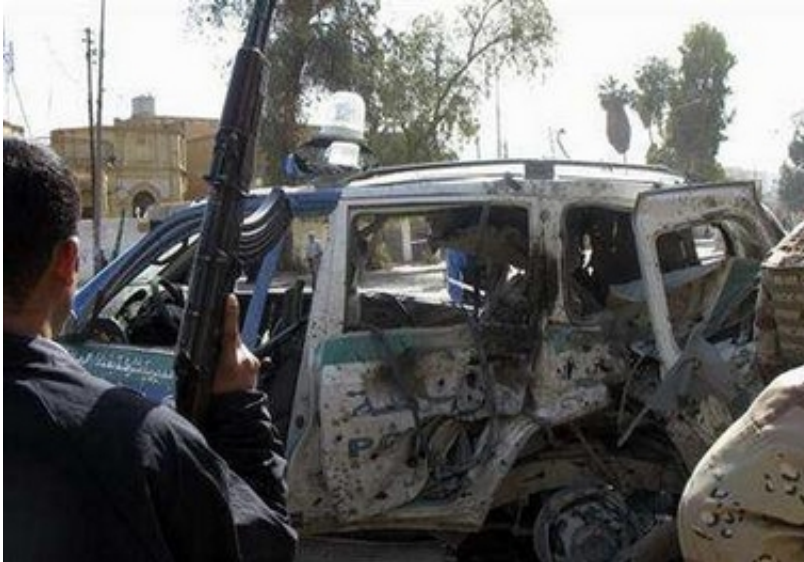
An Iraqi policeman holds a weapon near a damaged police vehicle after a roadside bomb attack in Baghdad March 8, 2006.

IF YOU DON'T LIKE THE RESISTANCE END THE OCCUPATION