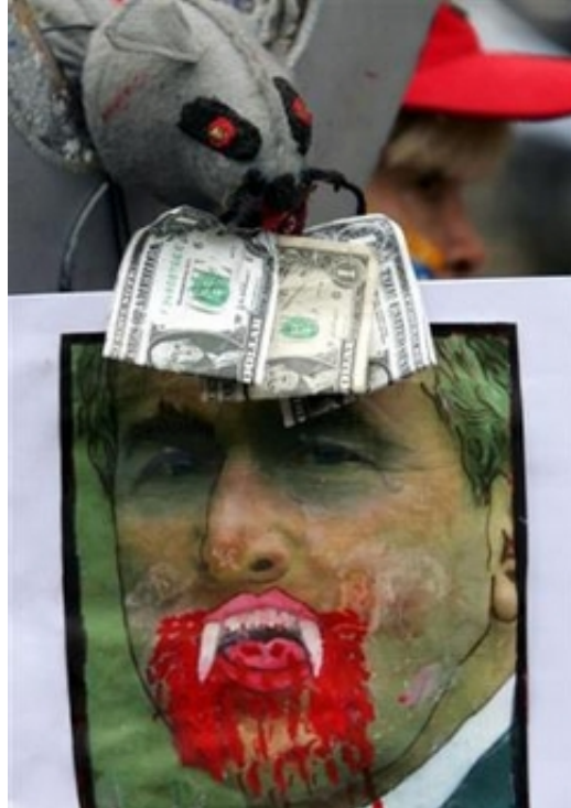
A poster during a rally in Caracas, Venezuela, March 8, 2006. Demonstrators marched to the U.S. Embassy to protest the war in Iraq, carrying a petition demanding an immediate pullout of U.S. troops.