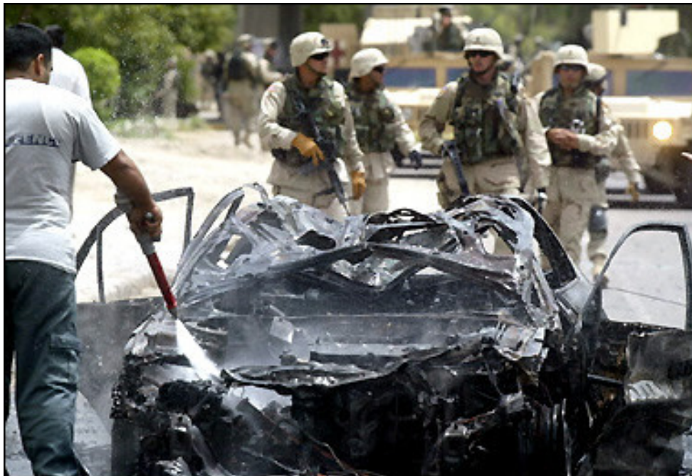
US soldiers following a car bomb on Kindi street, in a western Baghdad neighborhood.

REALLY BAD IDEA: NO MISSION; HOPELESS WAR