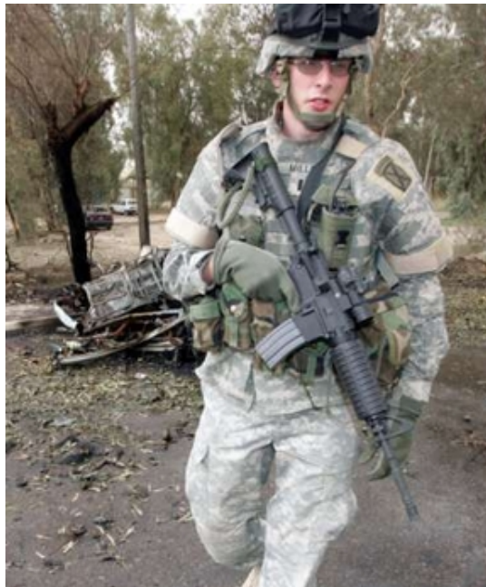
A U.S. soldier at the scene of a car bomb attack in Baghdad March 9, 2006.