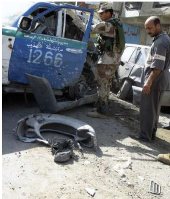
A damaged police vehicle after a roadside bomb attack in Baghdad March 8, 2006. Two policemen were killed in the attack, police said.