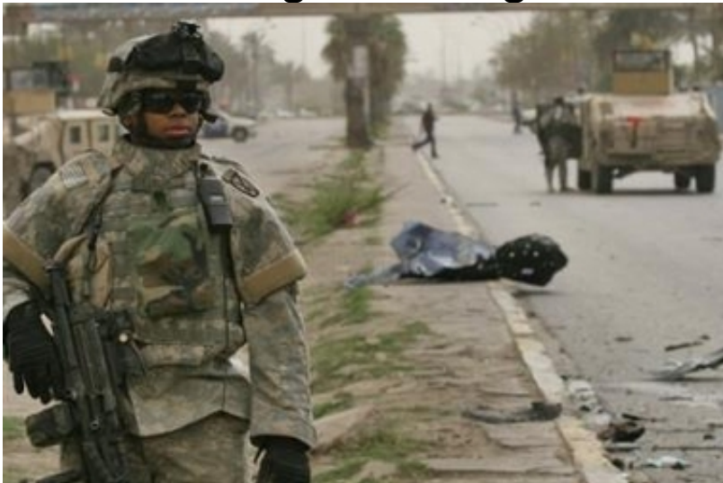
U.S. soldier at the site of a car bomb explosion, in Baghdad March 9, 2006.