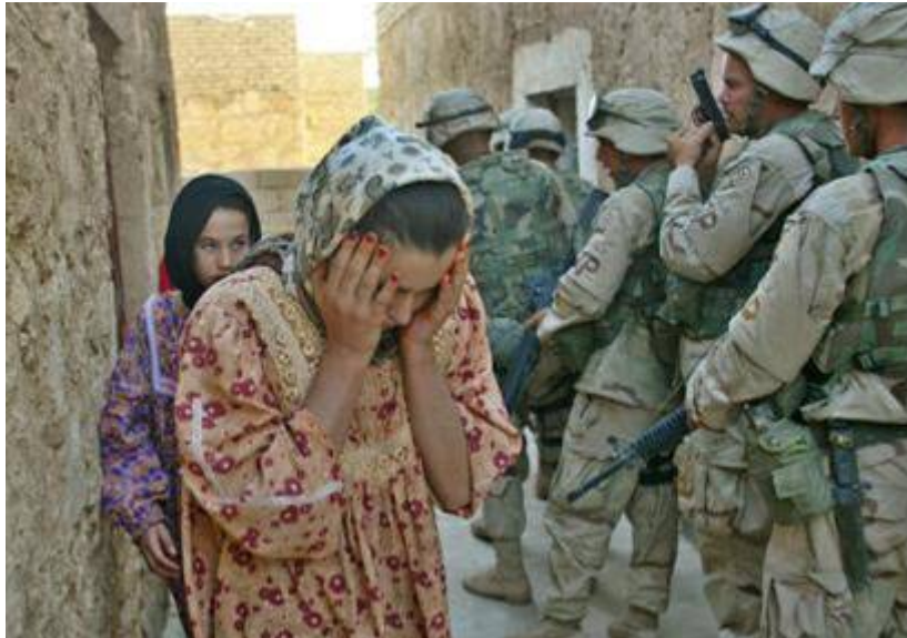
An Iraqi citizen forced out of her house as U.S. troops raid at Khaldiya June 16, 2003. Hundreds of US troops backed by tanks and helicopters raided several cities and villages on the second day of 'Operation Desert Scorpion'.