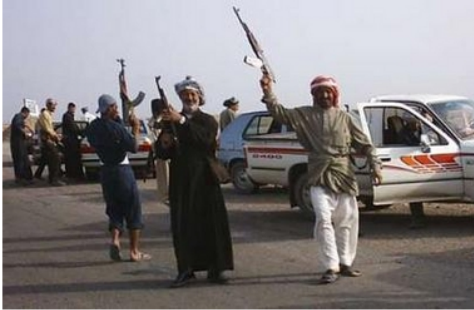
Iraqi insurgents raise their weapons as they stop traffic near Samarra March 21, 2006.