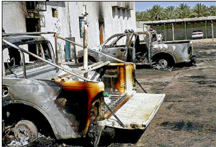
Destroyed Iraqi police cars in Moqdadiyahd. Hundreds of rebels stormed an Iraqi police station in a pre-dawn raid to free inmates, triggering the deadliest firefight this year, which left 18 police and 10 insurgents dead.