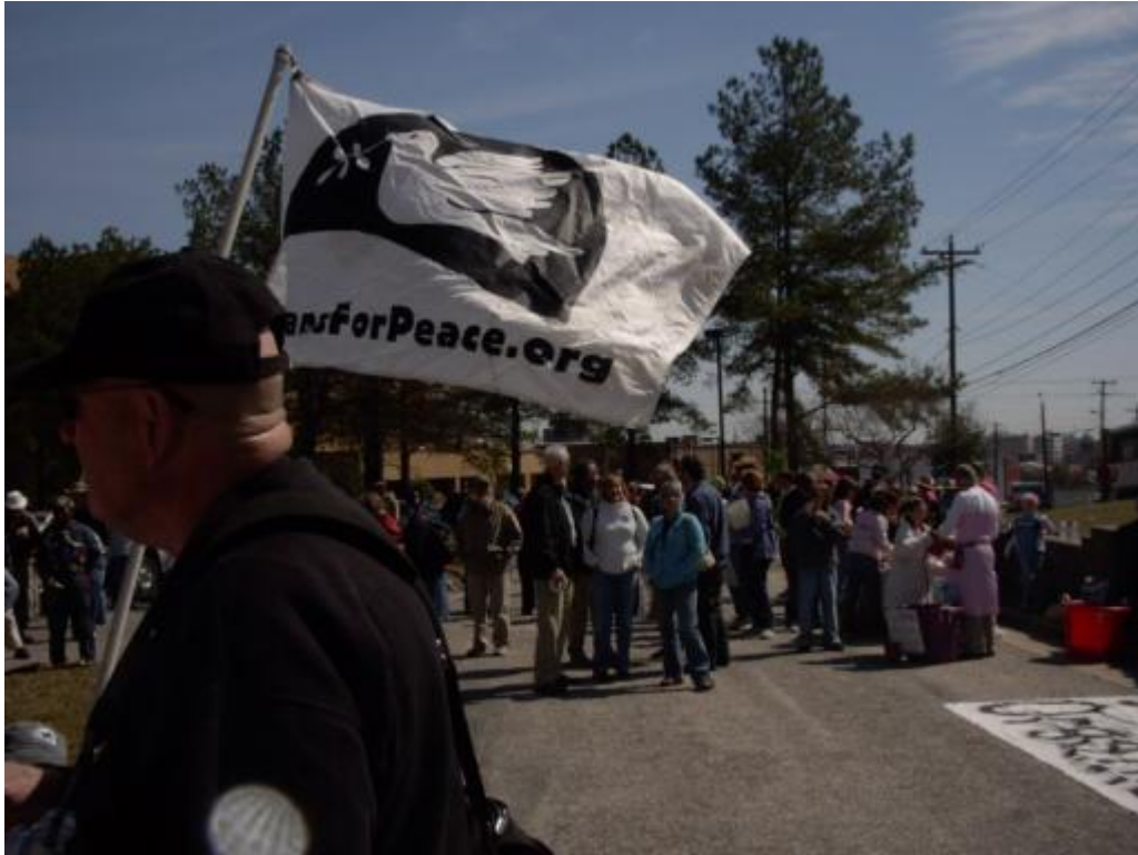
Rally against the war At Fayetteville, N.C. 3.18.06