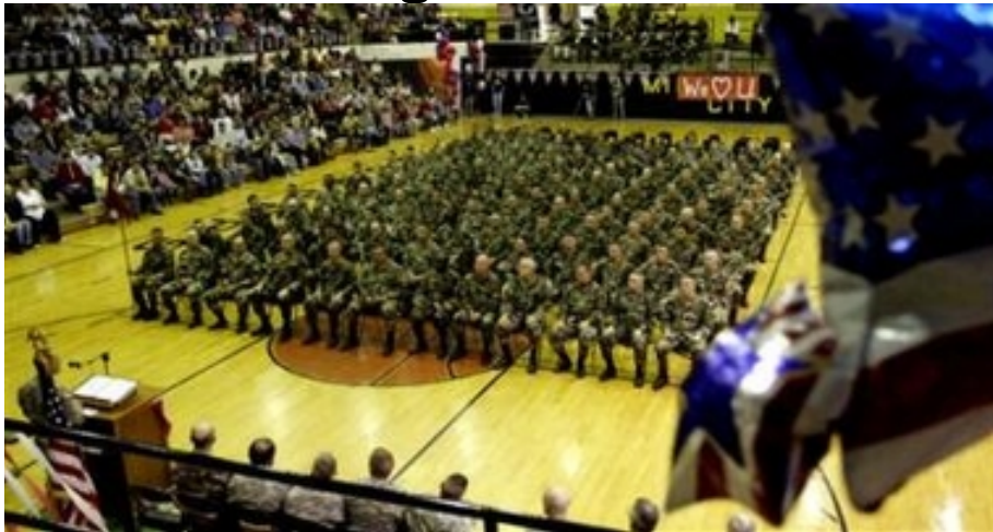
Members of the 1345th Transportation Company, Oklahoma Army National Guard, March 24, 2006, in Midwest City, Okla., as they prepare to deploy to Iraq.