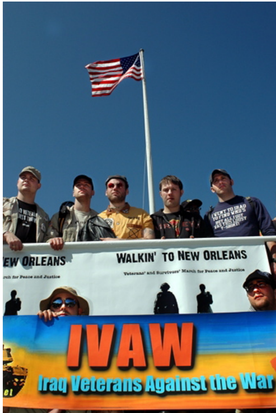
IVAW, Mobile, Alabama

Veterans and Survivors march from Mobile to New Orleans