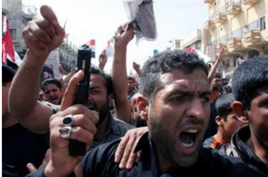
Iraqi citizens shout anti American slogans, after Friday prayers, in Baghdad, March 24, 2006.

OCCUPATION ISN'T LIBERATION BRING ALL THE TROOPS HOME NOW!