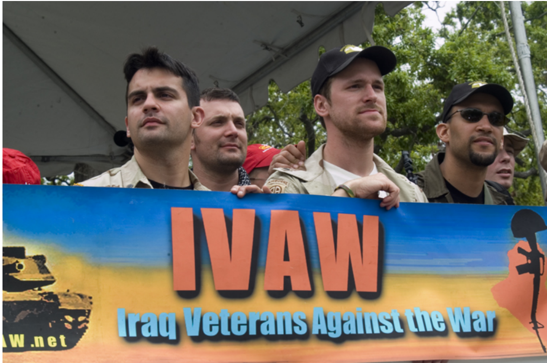
March 18 and 19, 2006. New Orleans: Walkin' to New Orleans. A coalition of veterans and military families and Hurricane Survivors walked from Mobile to New Orleans for the 3rd Anniversary of the war in Iraq.

Pentagon Traitors At It Again: Army Making Wounded Iraq War Vet Repay Enlistment Money: They Confiscated His Pay Check; Sent Collection Agency After Him