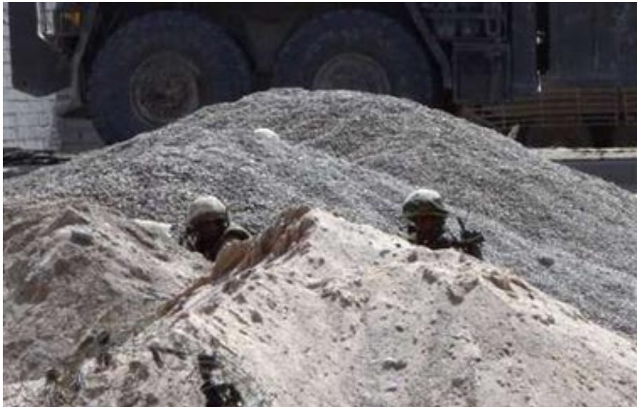
British soldiers take up position after they were attacked in Amara February 28, 2006. Two British soldiers were killed and a third was wounded in an attack on their patrol.