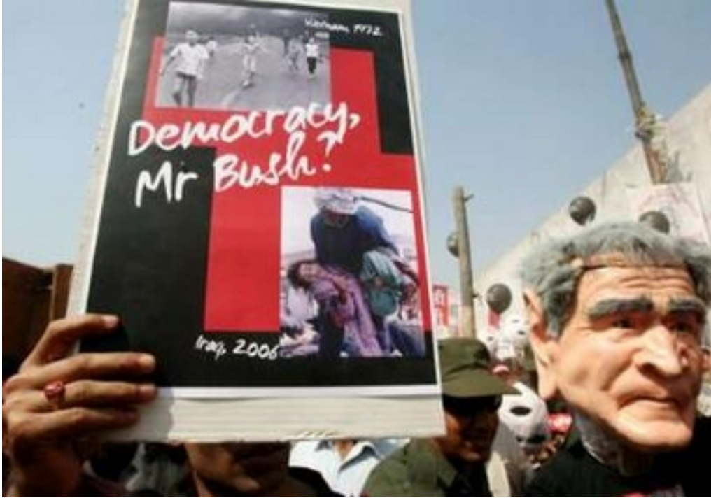
Protest against the visit of U.S. President George W. Bush in New Delhi March 2, 2006.