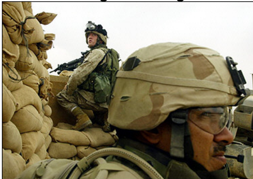
A US marine and a US Army soldier man their position on the rooftop of a hotel in Ramadi.

So Much For “That Progress In Iraq” Bullshit