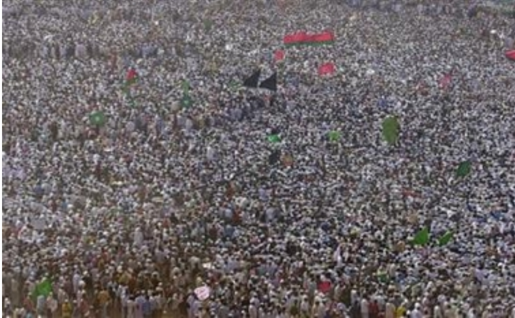
Indian protesters against the visit of Bush to India, in Bombay, India, March 2, 2006.