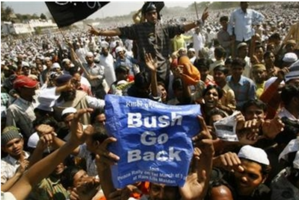
Indian protesters rally against Bush in New Delhi March 1, 2006.