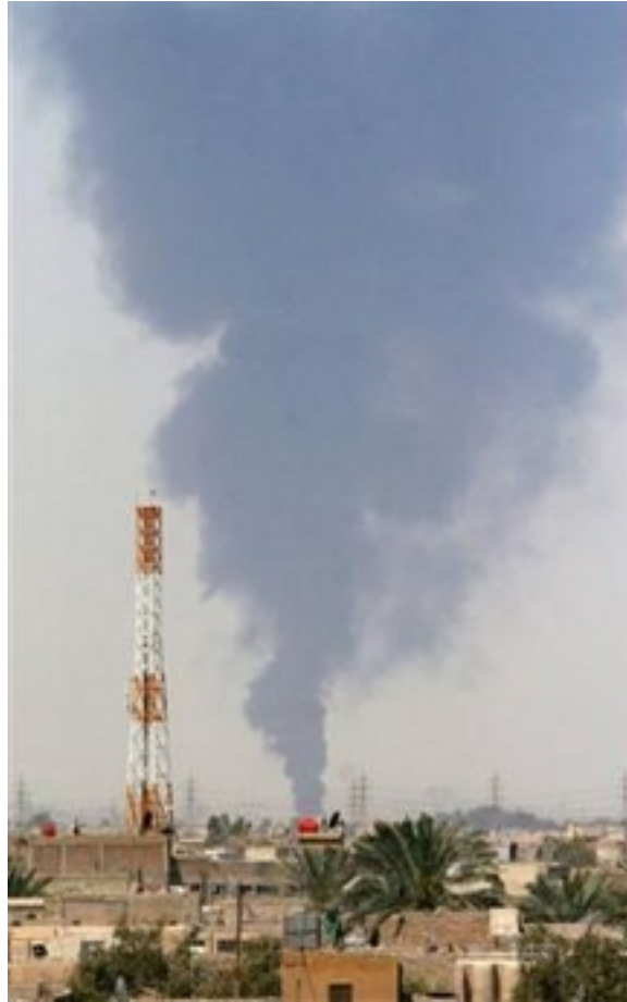
Smoke rises from a pipeline explosion March 31, 2006 in Baghdad. Insurgents set off explosives underneath an oil pipeline on the outskirts of Baghdad Friday.

IF YOU DON'T LIKE THE RESISTANCE END THE OCCUPATION