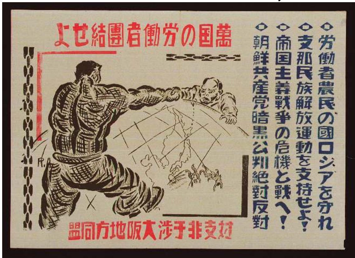
Japanese anti-imperialist poster from late 1920s, by the Alliance Against Intervention in China.

[With respect and thanks to the brother who sent in these excerpts and graphics. T)