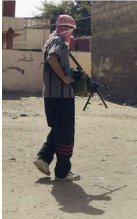
A resistance soldier patrols a street in Ramadi April 10, 2006.