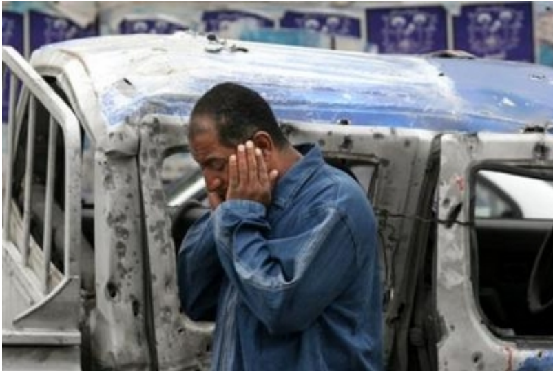
A police vehicle destroyed by a car bomb which targeted a police patrol, killing a policeman and two civilians April 12, 2006 in Baghdad.