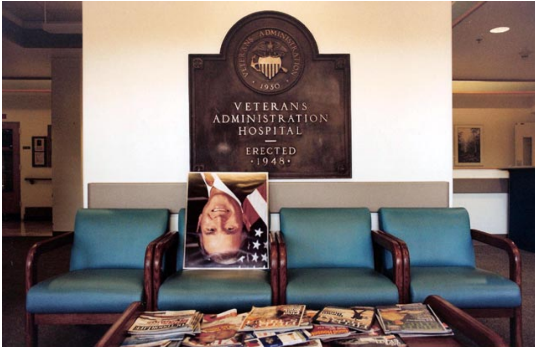
Veterans Hospital in Spokane, Washington 2003.

2,350 American Soldiers killed in Iraq. 18,000 American soldiers wounded in Iraq. Hundreds of thousands of Iraqi citizens killed.