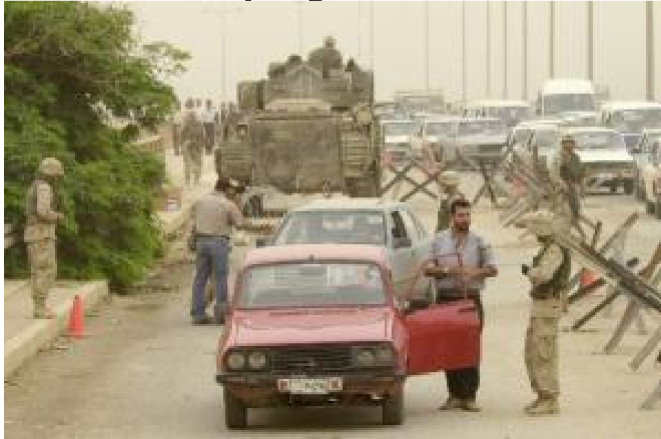
United States Army soldiers looking for weapons stop and search Iraqi citizens at a roadblock in Baghdad, May 31, 2003.

OCCUPATION ISN'T LIBERATION BRING ALL THE TROOPS HOME NOW!