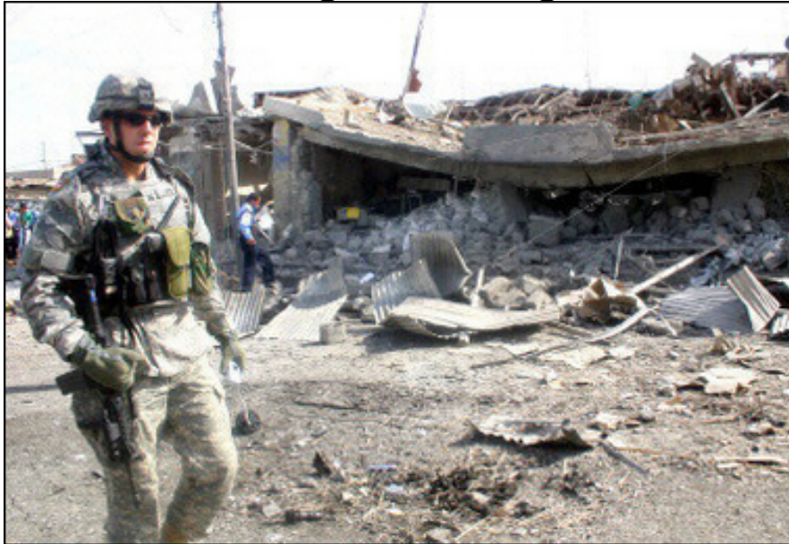
A US soldier at a police station damaged in a blast in Mosul.

THERE IS ABSOLUTELY NO COMPREHENSIBLE REASON TO BE IN THIS EXTREMELY HIGH RISK LOCATION AT THIS TIME, EXCEPT THAT A TRAITOR WHO LIVES IN THE WHITE HOUSE WANTS YOU THERE, SO HE WILL LOOK GOOD. That is not a good enough reason.