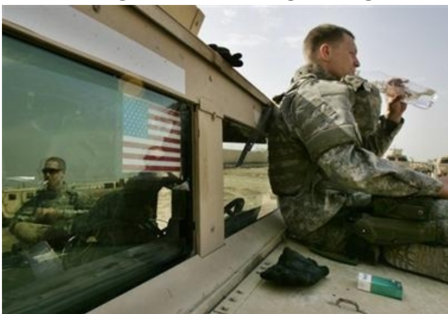
A U.S. soldier before a patrol in Baghdad, April 16, 2006. U.S. troops have begun placing American flags on their windshields in order to distinguish their humvees from those used by Iraqi troops.