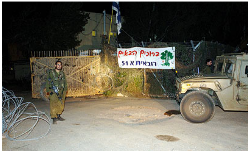
Entrance to post on northern border abandoned by rebelling soldiers.

[Thanks to Max Watts, who sent this in.]