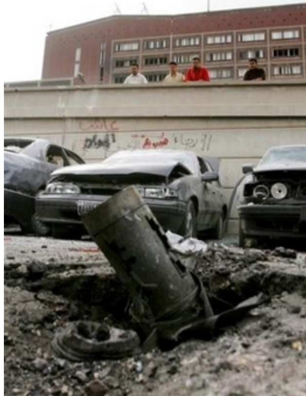
A rocket which exploded near the heavily fortified green zone April 23, 2006 in Baghdad.