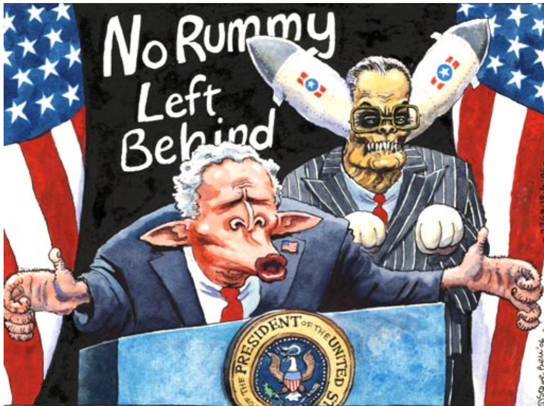
[Steve Bell Cartoon]

Members Of Congress Never, Ever Faced With Losing The Big Money They Vote Themselves