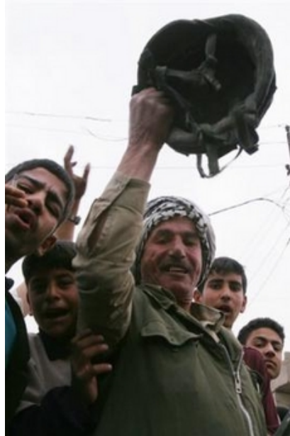
Celebrating Iraqis hold up a U.S. helmet after a roadside explosion targeting a US Patrol destroyed a Humvee April 2, 2006 in Ramadi, Iraq.

Nothing Is More Important Today Than Forging New Links With The Troops Turning Against This War: