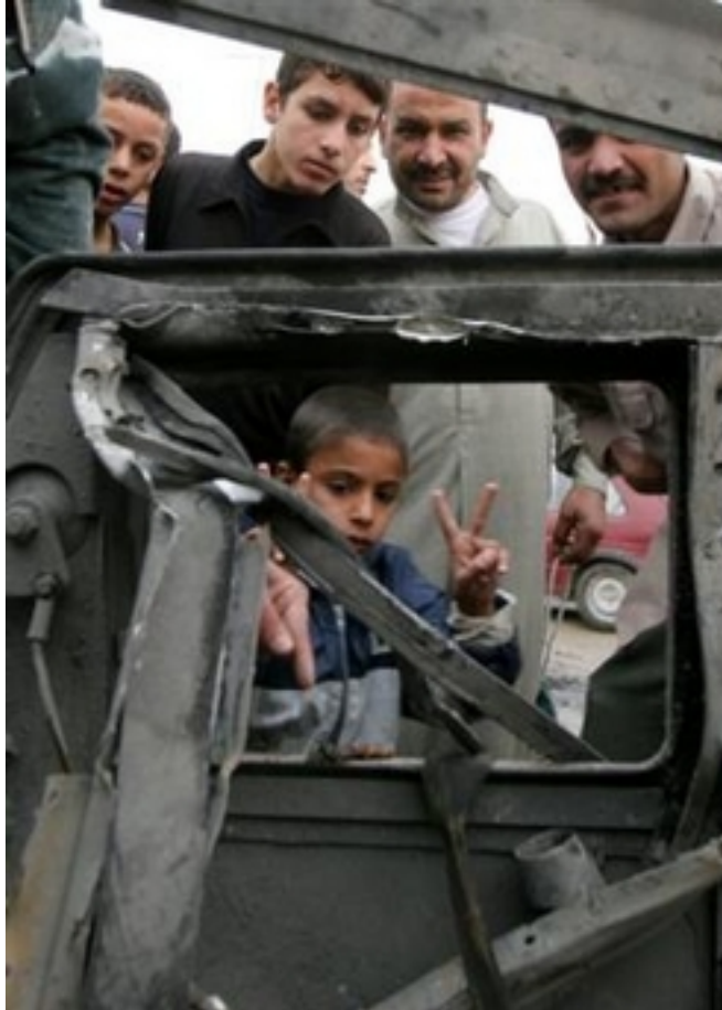
Iraqi's look at the wreck of a humvee hit by a roadside bomb April 2, 2006 in Ramadi.

“A National Movement, Which Opposes Occupation And Sectarianism, Has Developed”