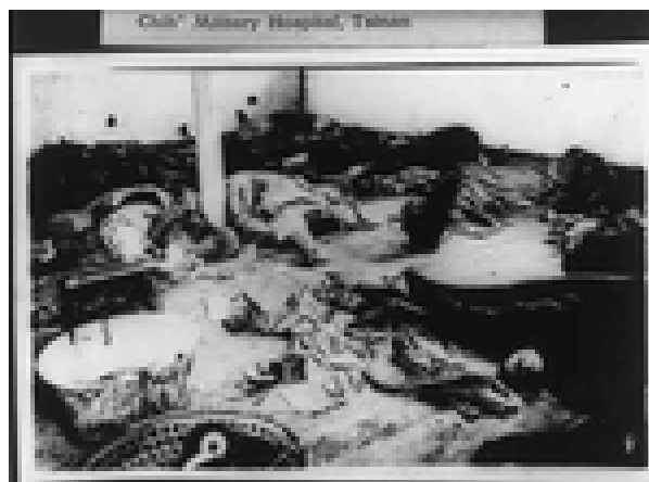
A Chinese hospital in Tsinan after the Japanese troops finished rampaging through it, massacring patients and staff.

[Thanks to the brother who sends in these selections. To be continued. T)