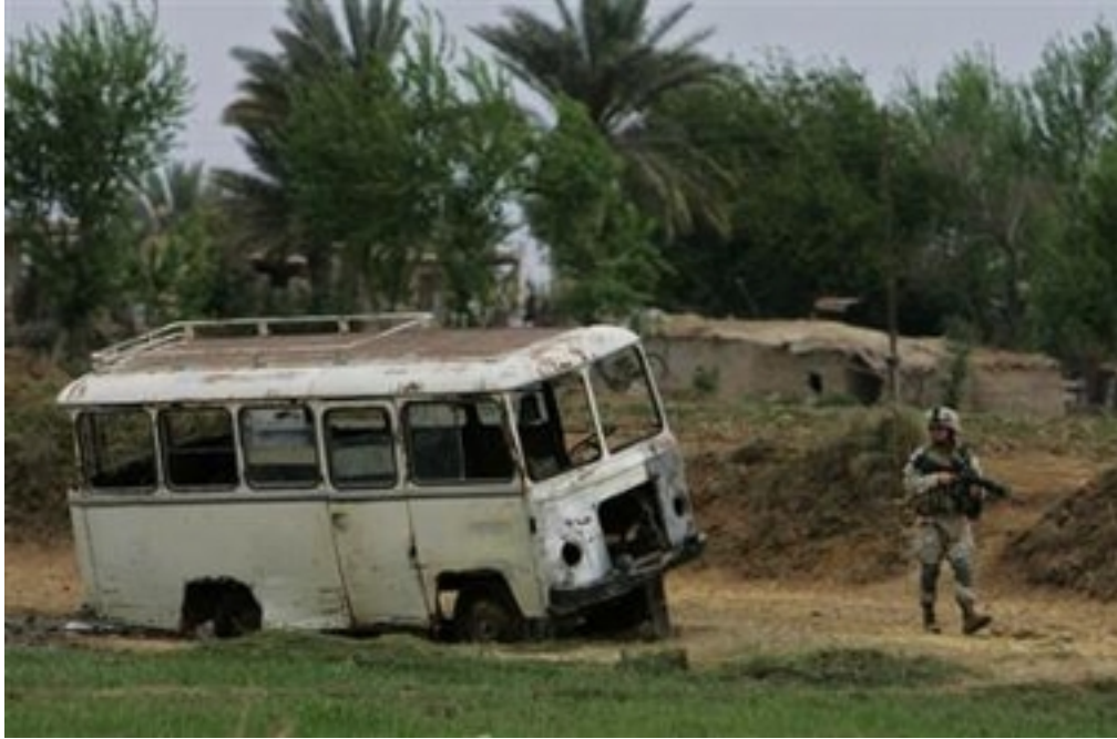
A U.S. Marine walks past a burned out bus near the Abu Ghraib prison April, 2006.

REALLY BAD IDEA: NO MISSION; HOPELESS WAR; BRING THEM ALL HOME NOW