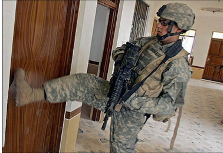
A US soldier kicks a door in Tal Afar, 02 April 2006.

[Fair is fair. Let's bring 150,000 Iraqis over here to the USA. They can kill people at checkpoints, bust into their houses with force and violence, overthrow the government, put a new one in office they like better and call it "sovereign," and "detain" anybody who doesn't like it in some prison without any charges being filed against them, or any trial.]