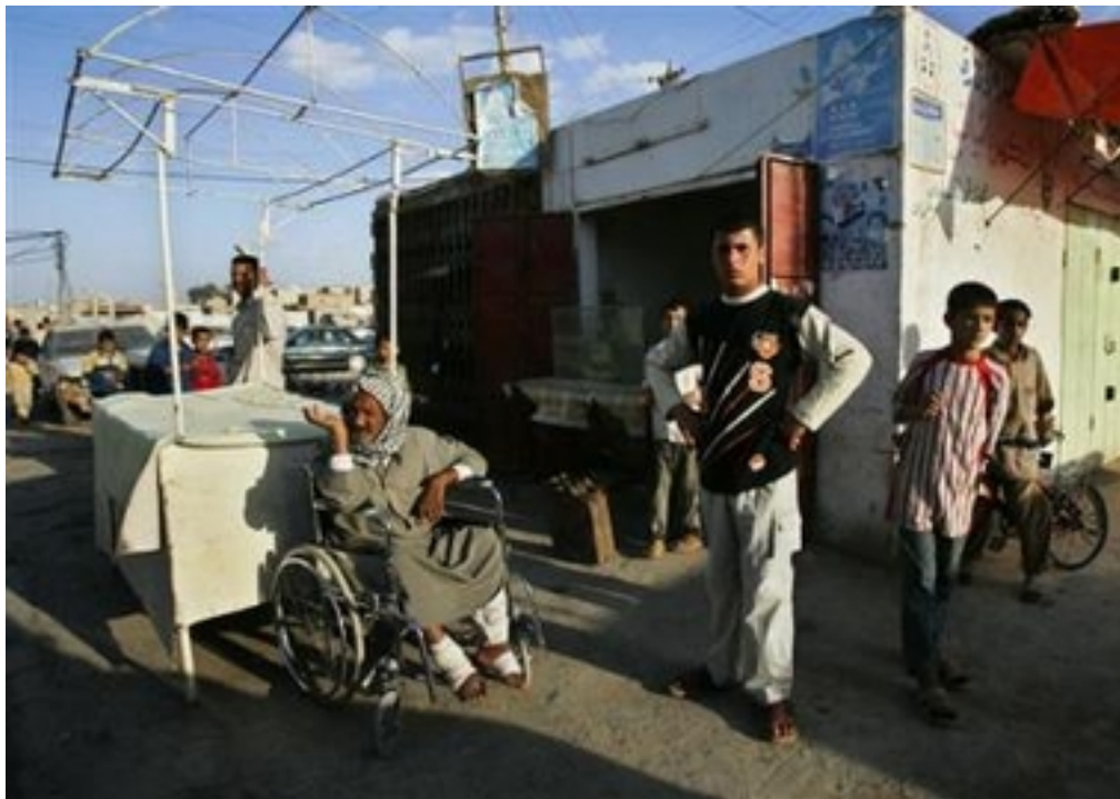
Iraqis stare at a passing U.S. Army humvee patrol in the Shula neighborhood of Baghdad April 7, 2006.