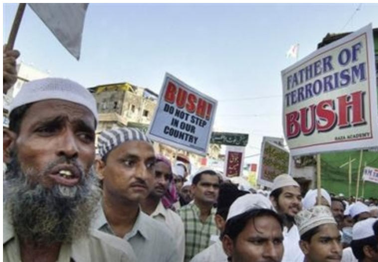
Demonstration against United States asking its troops to withdraw from Iraq immediately in Bombay, India, May 10, 2006.