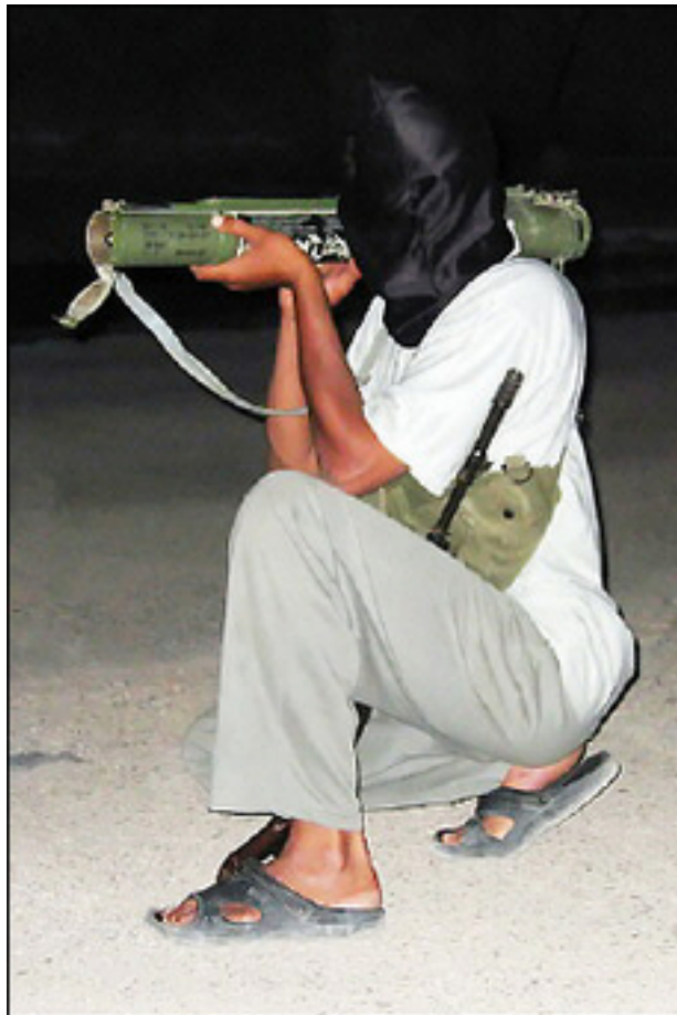
An insurgent with a shoulder-fired rocket in Ramadi.