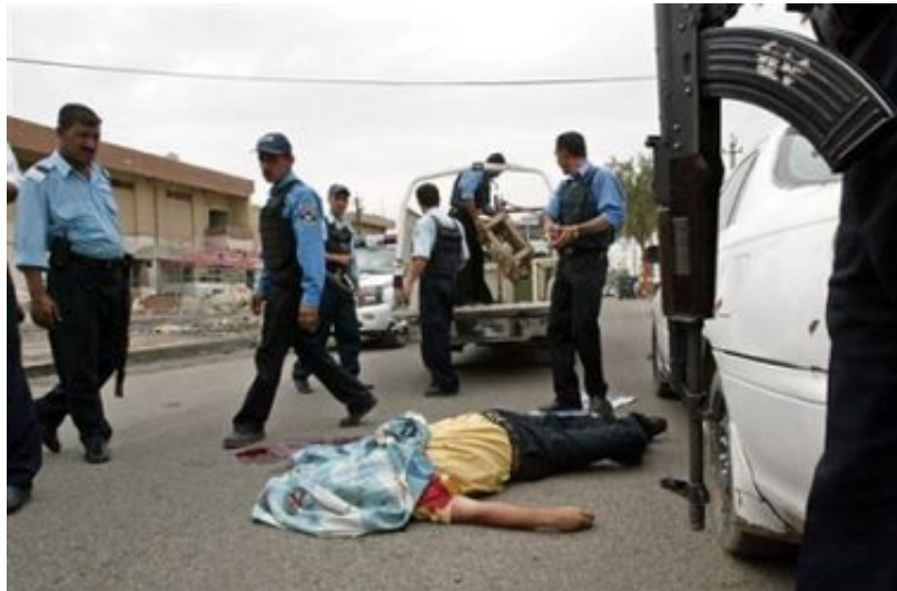
Dead policeman following an attack in Baghdad, May 10, 2006. Insurgents opened fire on two officers, killing both in the Mansur area in western Baghdad.

A roadside bomb targeting an Iraqi Army patrol near the central neighborhood of Karrada killed one soldier.