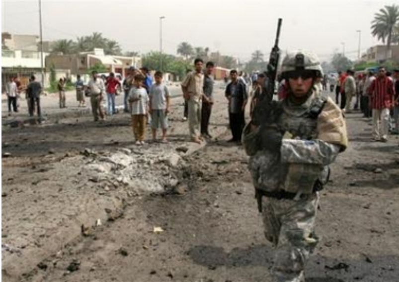
U.S. soldier in Baghdad, May 8, 2006 at scene of car bomb attack.