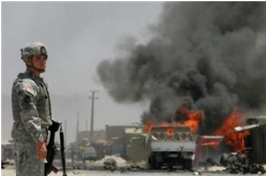
A U.S. soldier at a car bomb site in Kabul, Afghanistan May 21, 2006.