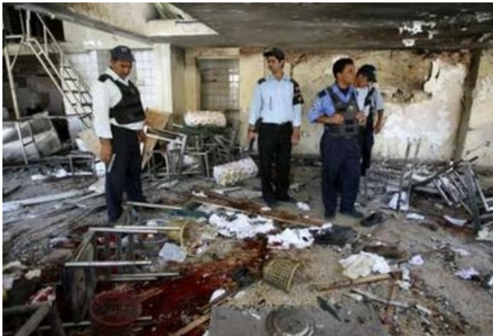
A bombing attack inside a crowded restaurant popular with the police in Baghdad May 21, 2006.