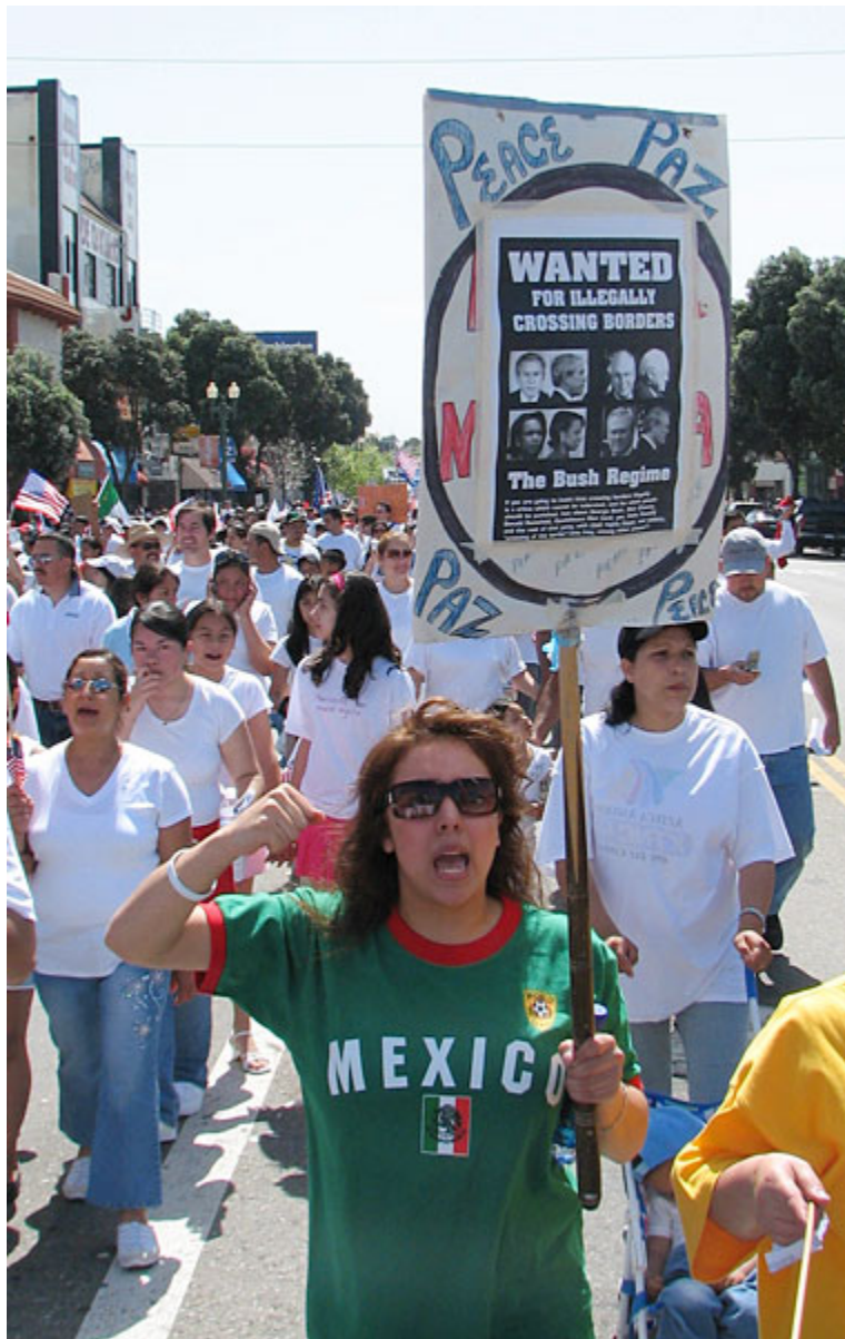
15,000 March On May 1st For Immigrant Justice In Oakland