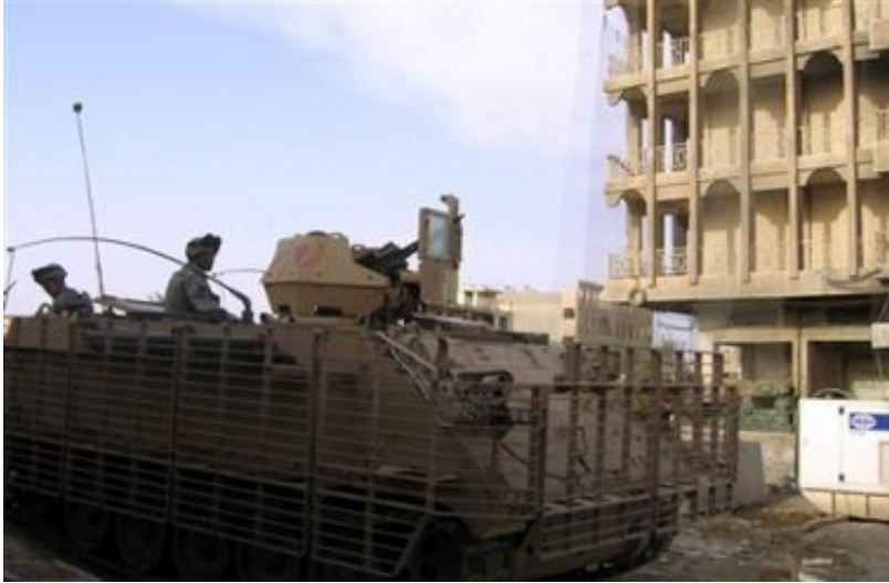
U.S. troops from the 1st Battalion, 506th Infantry Regiment drive atop of an armored personal carrier outside OP Hotel in Ramadi, Iraq, April 21, 2006.