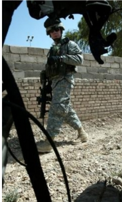
An U.S. soldier walks past wreckage of a car bomb following an explosion in Baghdad, May 12, 2006. A car bomb exploded near a U.S. convoy.

REALLY BAD IDEA: NO MISSION; HOPELESS WAR: BRING THEM ALL HOME NOW