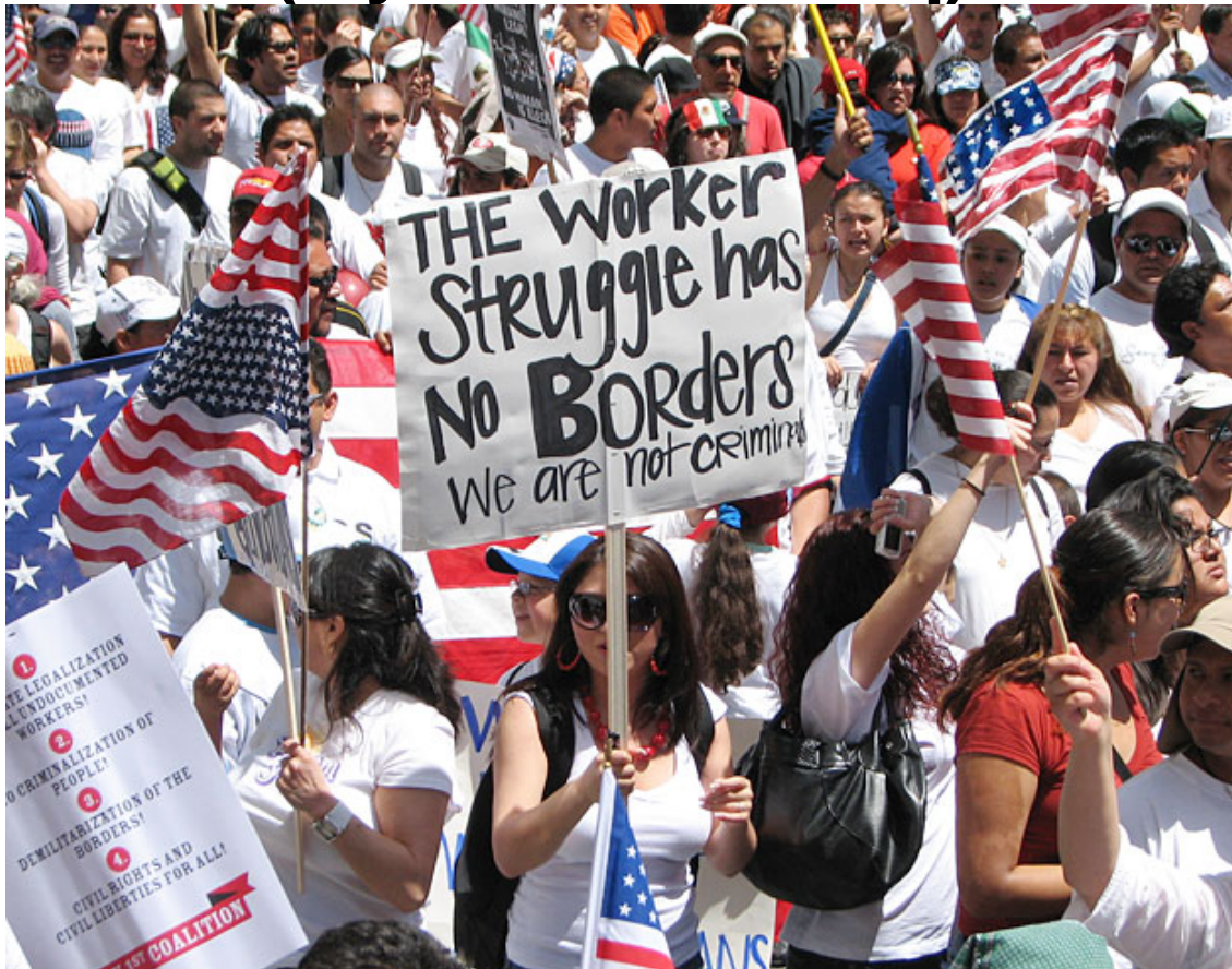
May. 02, 2006 at 10:39 AM. jeff@paterson.net

San Francisco, California (May 1, 2006)