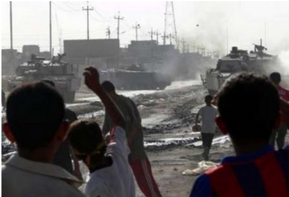
Iraqi children throw stones on the British tanks patrolling the streets of Amara June 11, 2006.

OCCUPATION ISN'T LIBERATION BRING ALL THE TROOPS HOME NOW!