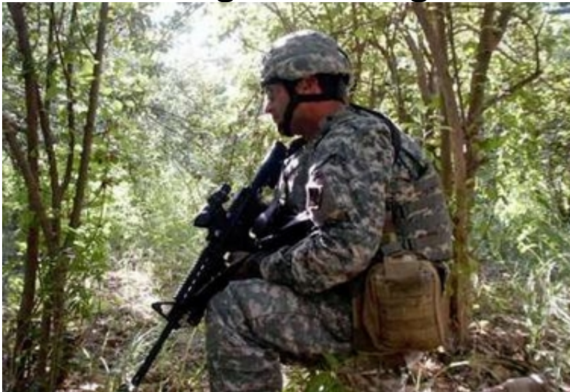
A U.S. soldier prepares to raid a garden on the outskirts of Baquba May 29, 2006.