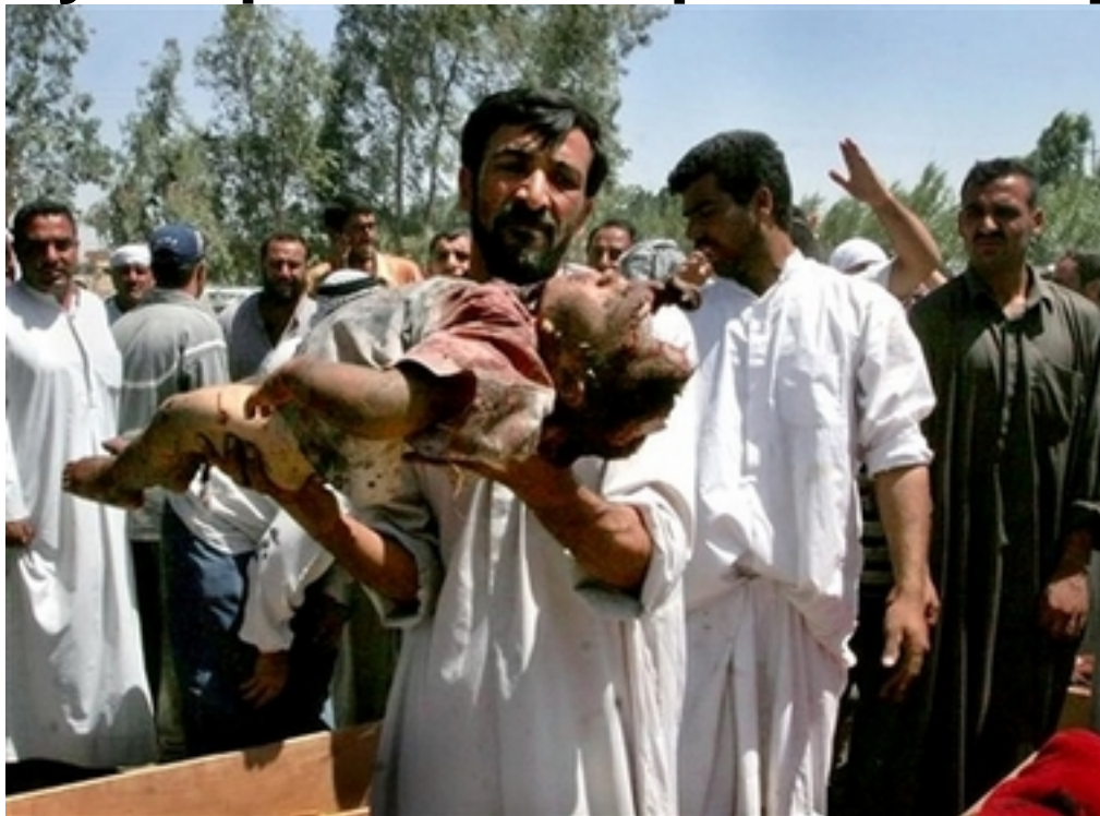
A man holds up the body of a small child killed by a U.S. raid near Baqouba, Iraq, June 12, 2006.

June 9, 2006 Karen Button, Uruknet.info [Excerpt]