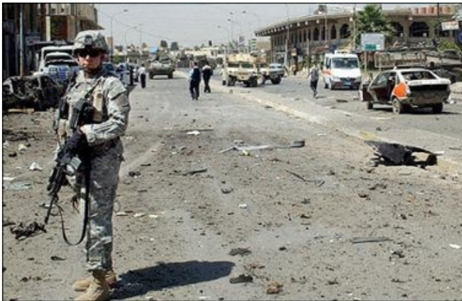
5.31.06 A US soldier secures the site where a car bomb exploded in the northern city of Mosul.

REALLY BAD IDEA: NO MISSION; HOPELESS WAR: BRING HIM HOME NOW