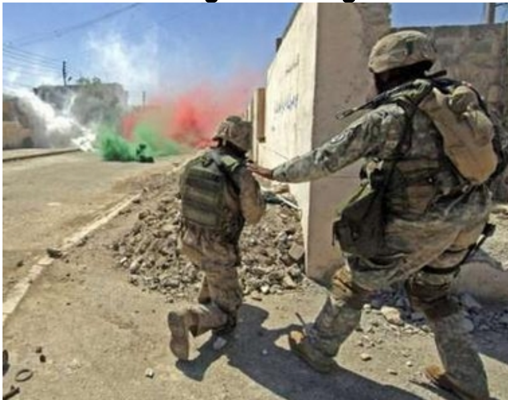
U.S. marines from the I Marine Expeditionary Force take their position near colored smokes to cover their movement during a firefight with insurgents in Ramadi June 15, 2006. (IRAQ)