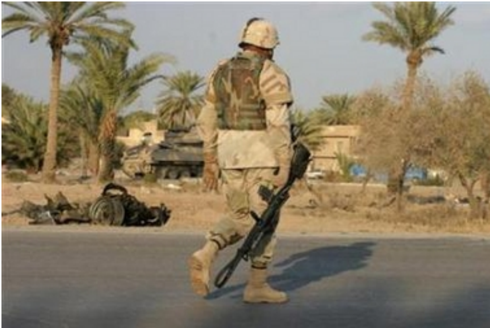
A weary U.S. soldier at the scene of a car bomb attack in Baghdad, February 3, 2005.

1 st ID Encounters 3,400 IEDs In Baghdad Since 1.1.06: U.S. General Says Only 2,108 Detonated “Thanks To Tips, Training And Better Equipment”