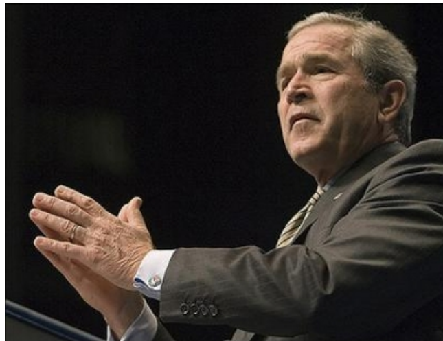
Bush, 5.22.06 in Chicago.

THUG TERRORIST MURDERER WHITED SEPULCHER UNFIT FOR COMMAND