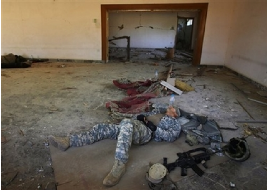
A U.S. Army soldier rests in Ramadi June 18, 2006.