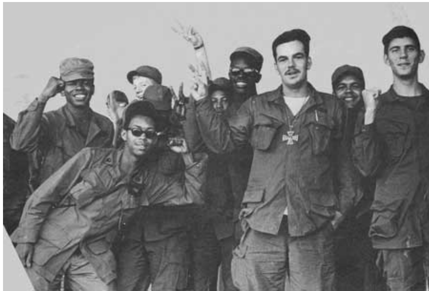
Vietnam: They Stopped An Imperial War

Today, let's make sure that "Sir! No Sir!" gets to this generation's enlisted people in Iraq.