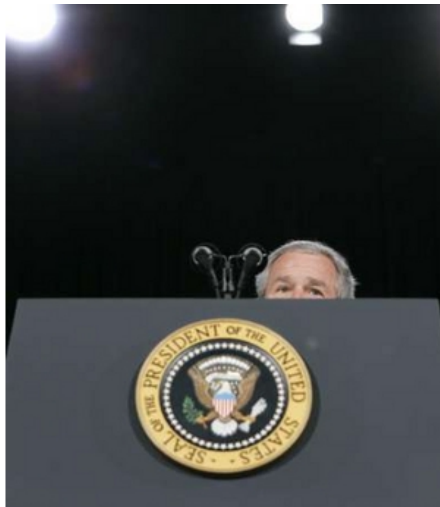
Bush at the U.S. Chamber of Commerce in Washington June 1, 2006. REUTERS/Larry Downing (UNITED STATES)