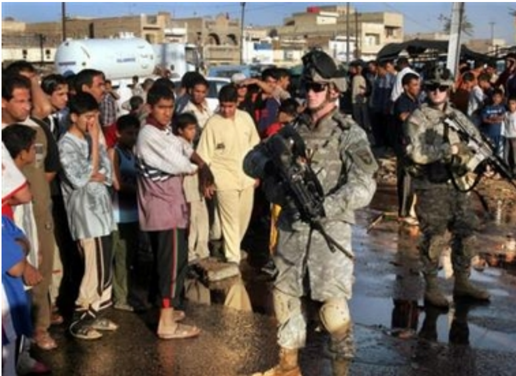
U.S. soldiers from the 101st Airborne Division in the Sadr City area of Baghdad May 20, 2006.