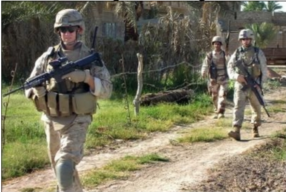
US marines patrol with an Iraqi collaborator soldier [guess which one he is] in an area in the town of Habbaniyah June 14.