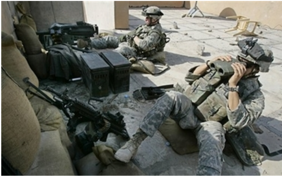
U.S. Army soldiers keep a watch in Ramadi, June 19, 2006.