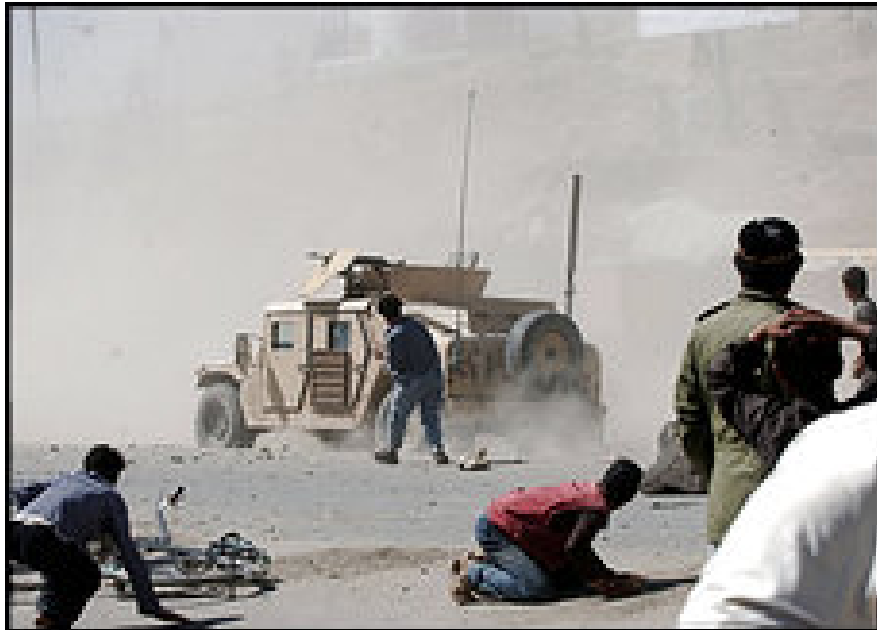
A U.S. military vehicle is the target of stones.

On one private videotape of a street incident, a guard could be heard shouting in the Dari language, "I am a Muslim. I am not an infidel. I am not an American. Please let me go."