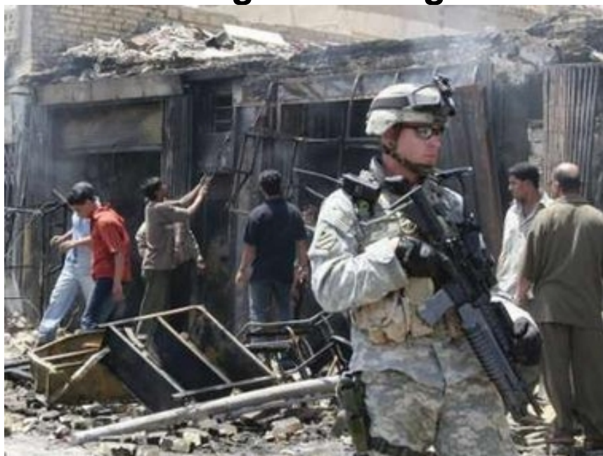
A U.S. soldier at the scene of a car bomb attack in the Shula district in Baghdad May 21, 2006.

THERE IS ABSOLUTELY NO COMPREHENSIBLE REASON TO BE IN THIS EXTREMELY HIGH RISK LOCATION AT THIS TIME, EXCEPT THAT A CROOKED RAT WHO LIVES IN THE WHITE HOUSE WANTS YOU THERE, SO HE WILL LOOK GOOD. That is not a good enough reason.