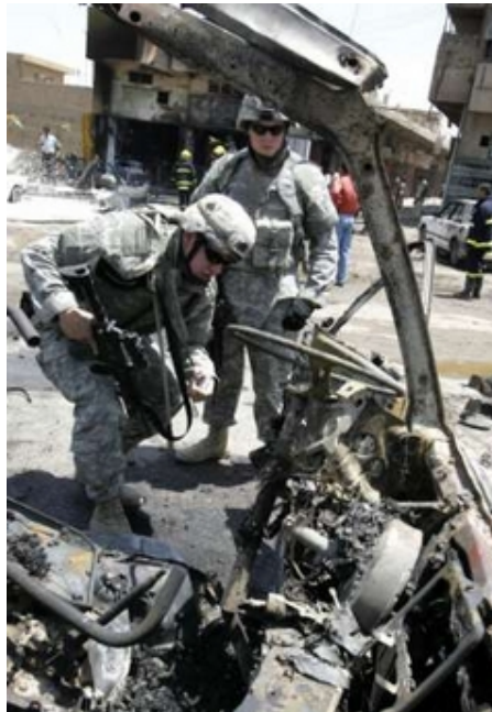
U.S. soldiers inspect the wreckage of a car used as a car bomb after an attack in Baghdad May 22, 2006.