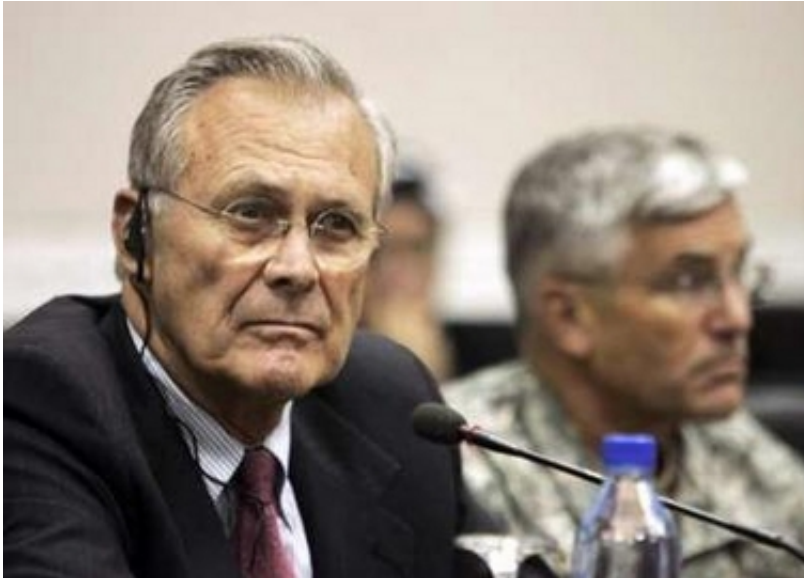
Rumsfeld and the U.S. commander in Iraq, General George Casey July 12, 2006.