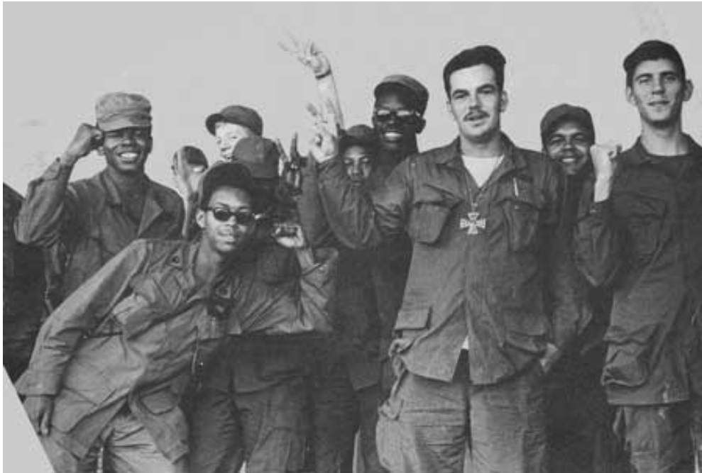
Vietnam: They Stopped An Imperial War

Also available will be a Soundtrack CD (which includes the entire song from the FTA Show, "Soldier We Love You"), theatrical posters, tee shirts, and the DVD of "A Night of Ferocious Joy," a film by me about the first hip-hop antiwar concert against the "War on Terror."