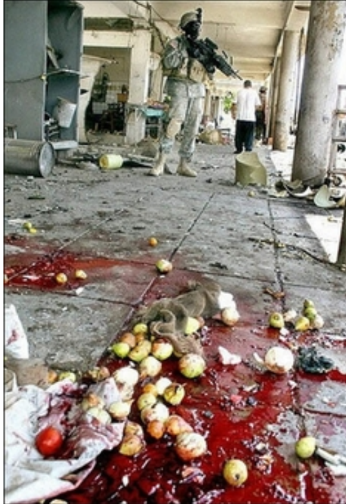
7.3.06: A US soldier where a car bomb exploded in Mosul.