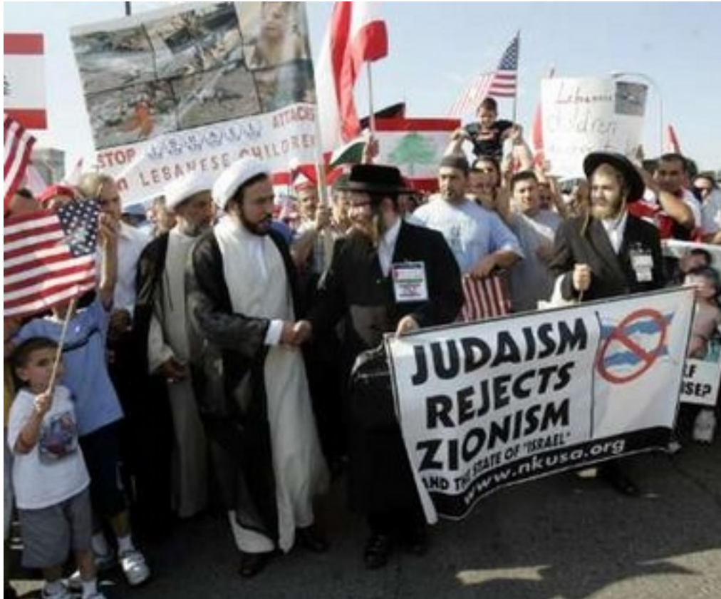
7.17.06: DEARBORN, MICHIGAN DEMONSTRATION AGAINST ISRAELI TERRORISM.

“Estoy En Contra De La Guerra Y Me Duelemucho Lo Que Paso A Mi Hijo”