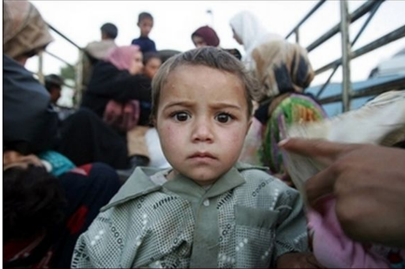
Hey Israel, You Missed One!