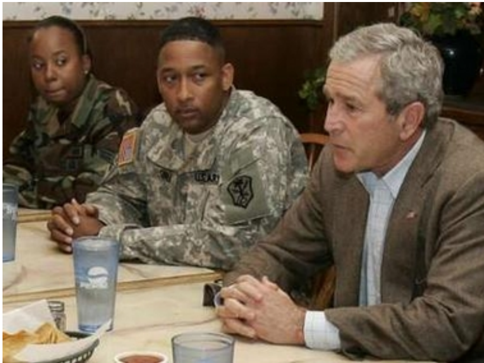
Bush take a publicity photo with military service personnel who recently returned from Iraq and Afghanistan used as window dressing in Aurora, Colorado, July 21, 2006. PHOTO: REUTERS/Jim Young (UNITED STATES)