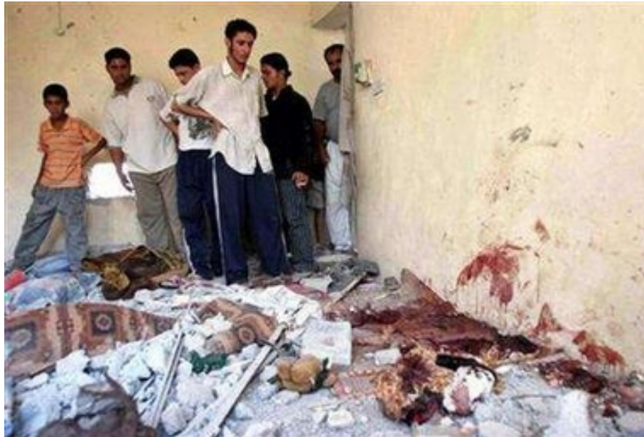
The house where six members of the same family were killed in Baqouba, northeast of Baghdad, July 21, 2006.

Iraqi police said a single man fired warning shots because he believed the soldiers were militiamen.