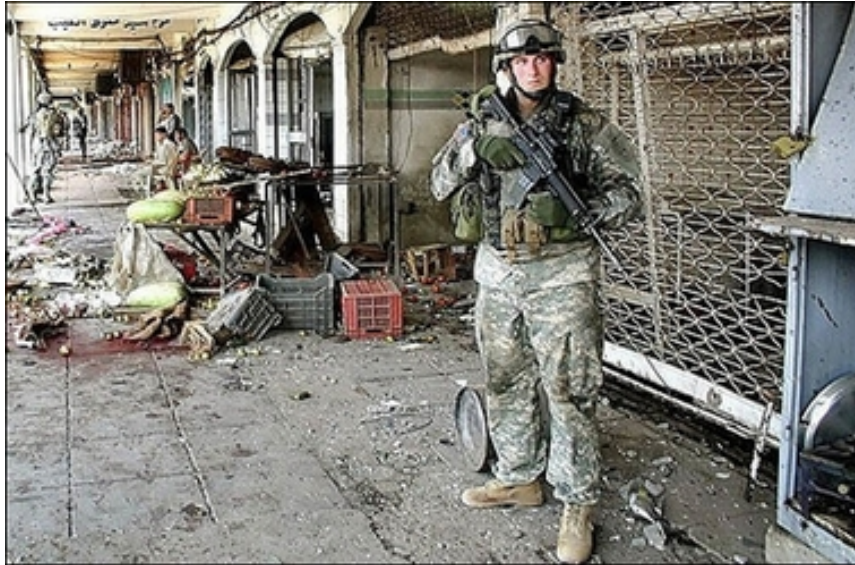
7.3.06: A US soldier at the site where a car bomb exploded in the Iraqi city of Mosul.