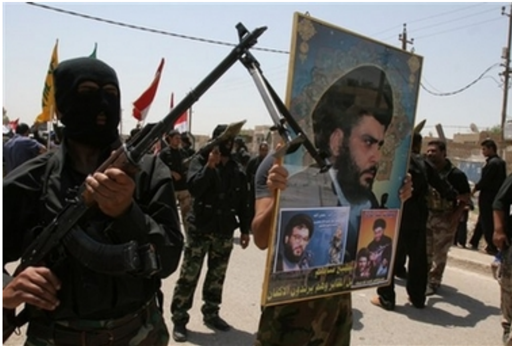
Members of Muqtada al-Sadr's Mahdi Army march with his portrait in a protest denouncing the Israeli attacks on Lebanon, July 21, 2006, in the Sadr City area of Baghdad, Iraq.