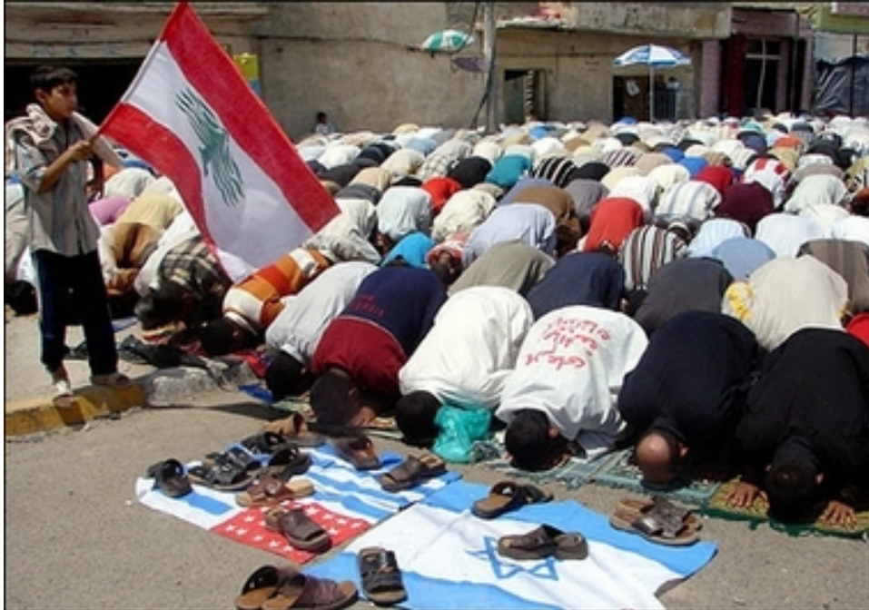
Shiite Iraqis put their shoes on the US and Israeli flags as a sign of insult to those countries in Baghdad's poor neighborhood of Sadr City.