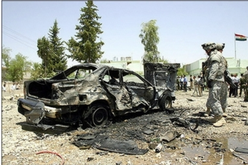
7.10.06: US military at the site of a car bomb attack in Kirkuk.