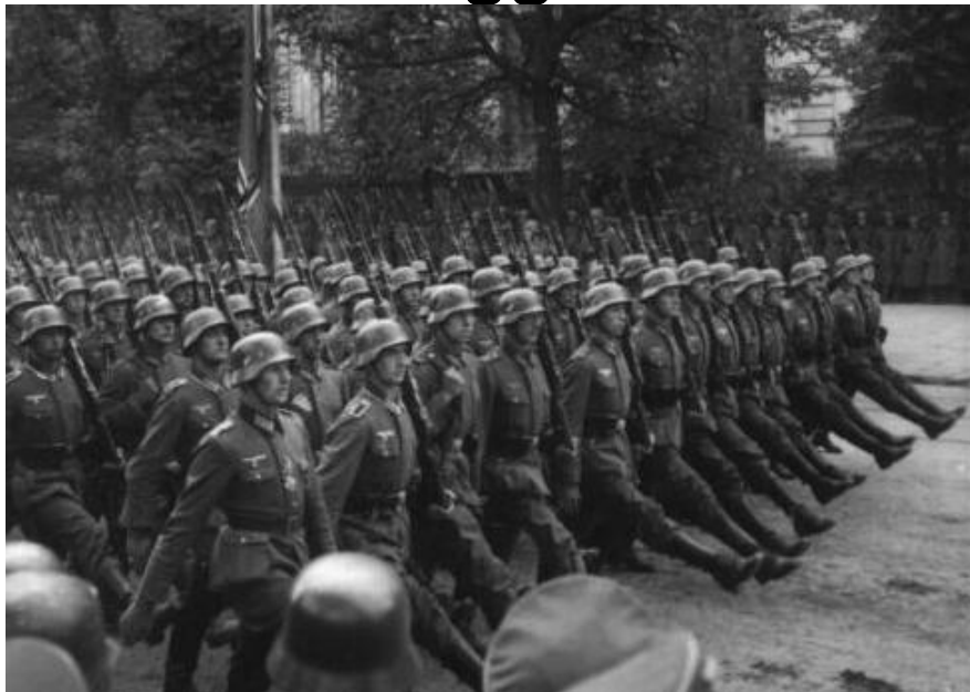
Invasion Of Poland, Sept. 1, 1939

Hitler said he had to stop Polish terrorists who were attacking Germany: "Imitation is the sincerest form of flattery."