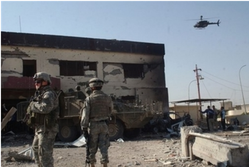
U.S. military at the area of a car bomb attack July 5, 2006, in Mosul, Iraq.