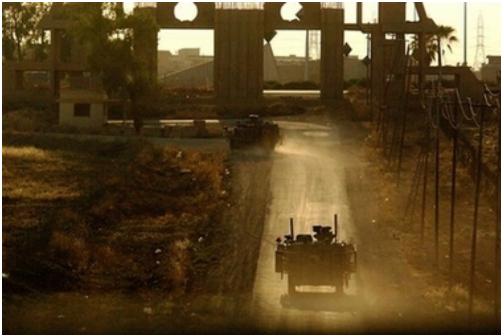
July 6, 2006: U.S. Army soldiers leave Forward Operating Base Marez in Mosul in a Stryker to conduct a cordon and knock patrol July 1, 2006. The soldiers are from 1st Battalion, 17th Infantry Regiment, 172nd Stryker Brigade Combat Team based out of Fort Wainwright, Alaska.