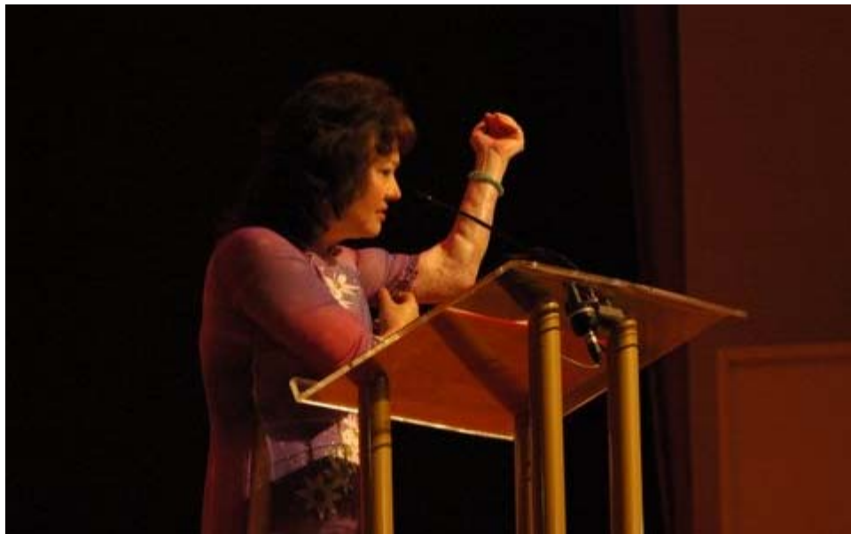
Kim Phuc today, showing the scars of American napalm