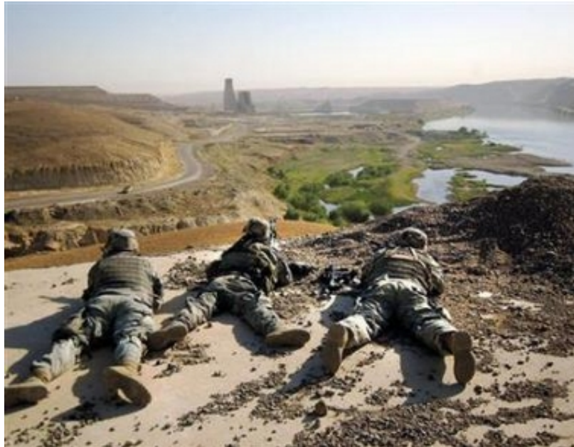
U.S. soldiers from 172nd Stryker Brigade Combat Team along the Tigris River near Mosul July 8, 2006.

REALLY BAD IDEA: NO MISSION; HOPELESS WAR: BRING THEM ALL HOME NOW