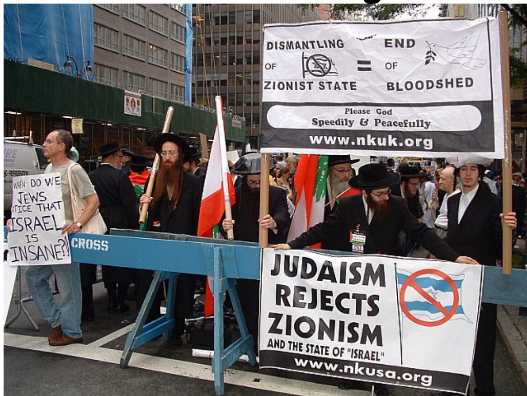
Photos of New York City protest against Israeli State Sponsored Terrorism and in Support of the Lebanese/Palestinian People! [Majed, 7/28/06]