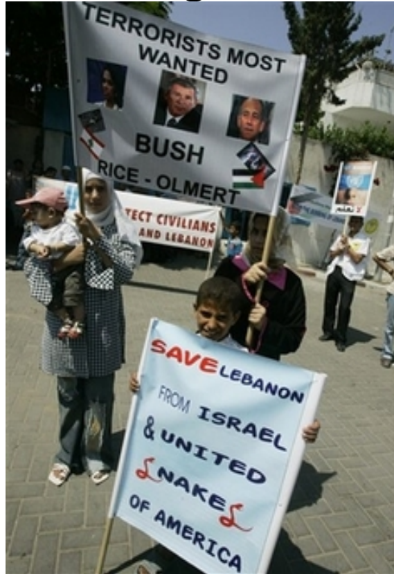
Palestinians demonstrate against Israeli slaughter of Palestinians and Lebanese in front of the European Union office in Gaza City, Sunday 30, 2006.