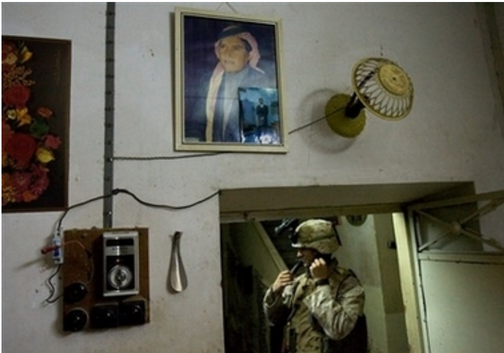
Foreign fighter from the U.S. armed forces occupying an Iraqi citizen's home in Ramadi, June 28, 2006. He stands under a portrait of the head of the household.

There's nothing quite like invading somebody else's country and busting into their houses to arouse an intense desire to kill you in the patriotic, self-respecting civilians who live there.