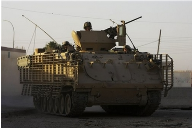
A Bradley Fighting Vehicle drives through Ramadi June 21, 2006.