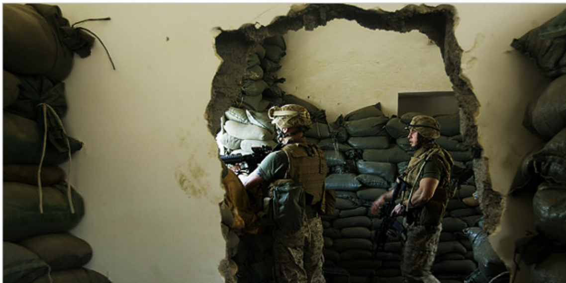
The provincial Government Center in Ramadi is defended by the Third Battalion, Eighth Marine Regiment.