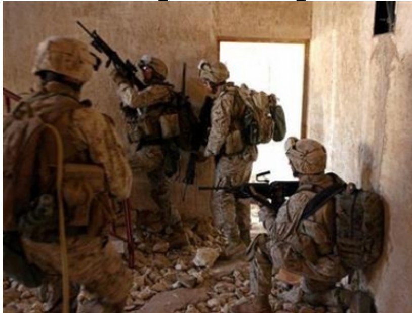
Marines from the Hawaii-based Lima Company, 3rd Battalion, 3rd Marine Regiment, prepare to clear the second storey of a house in Barwana, Iraq, June 16, 2006.