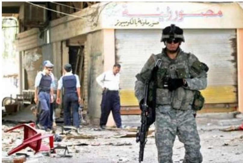
A U.S. soldier at the site of a bomb attack in Kirkuk July 19, 2006. REUTERS/Slahaldeen Rasheed (IRAQ)