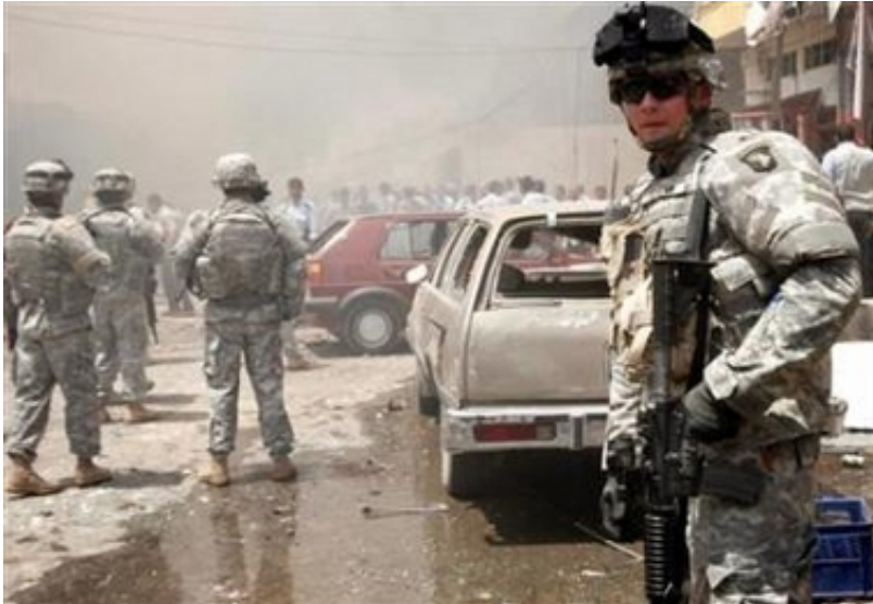
U.S. soldiers at the site of a car bomb attack outside a court house in Kirkuk, July 23, 2006.