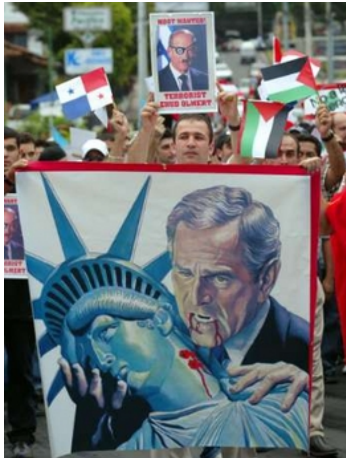
The Association of United Arab Nations and Panamanians protest against the war in Lebanon in front of the Israeli embassy in Panama City August 3, 2006. (PANAMA)