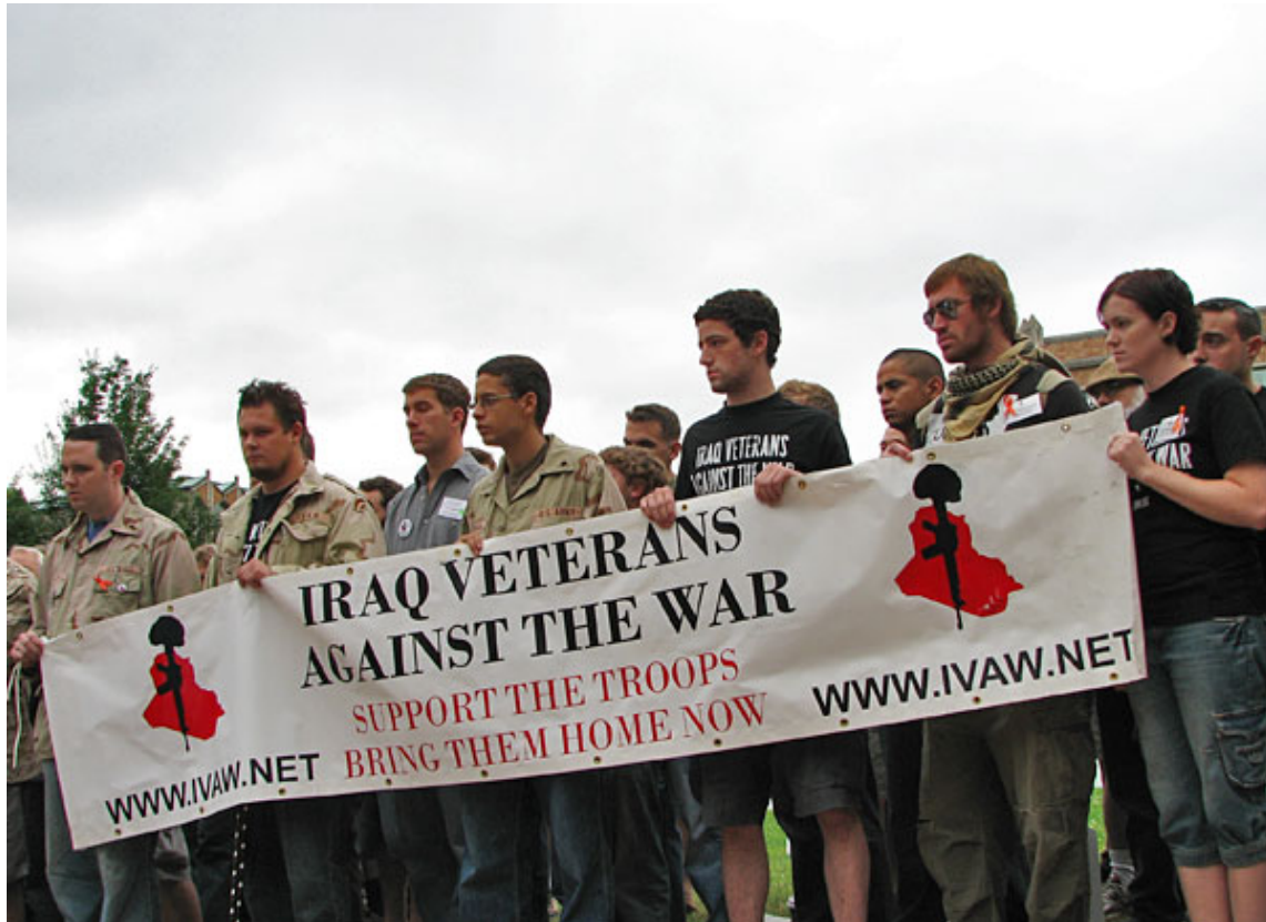
Seattle, August 11, 2006: Iraq Veterans Against the War.