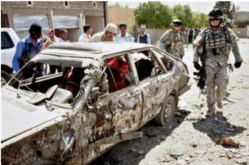
U.S. soldiers arrive at the site of a car bomb attack in Kirkuk, July 26, 2006.

In Western Iraq, Insurgency Is Gaining; “U.S. Commanders Have Said Privately That A Military Solution To The Insurgency In Anbar Is Impossible”